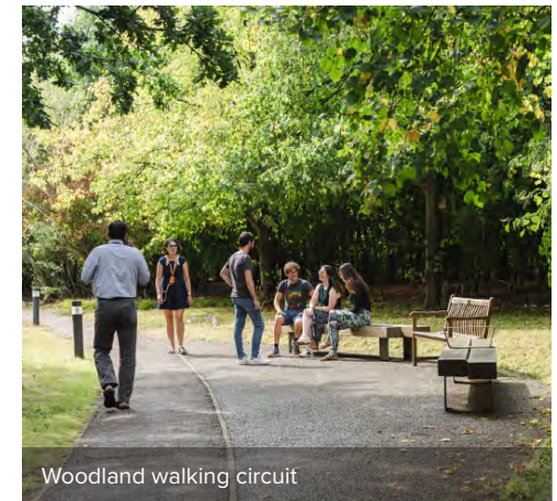
Woodland walking circuit