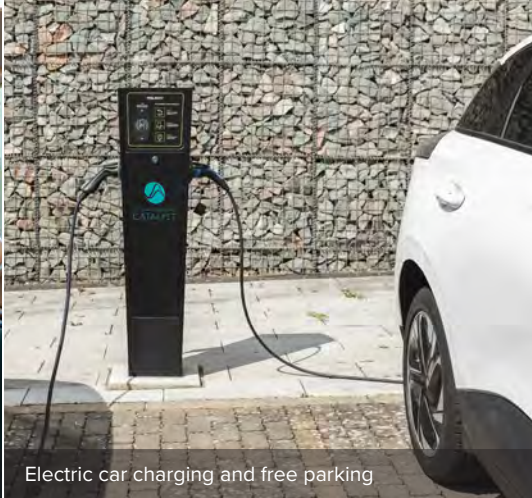
Electric car charging and free parking