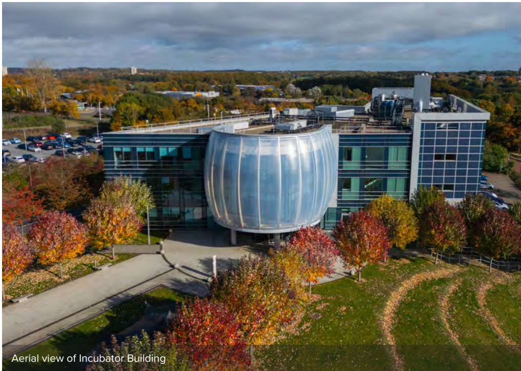
Aerial view of Incubator Building

“The ecosystem at SBC enabled us to spin out not one but two companies, to secure over £60m from global investors and attract the talent we need to progress our much-needed therapies for chronic conditions.”