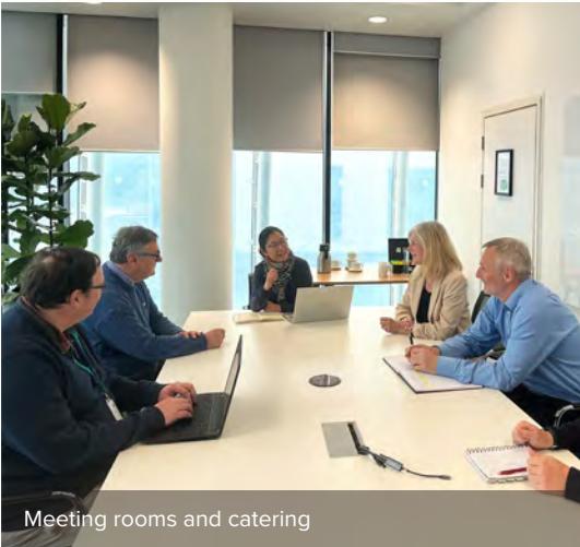
Meeting rooms and catering