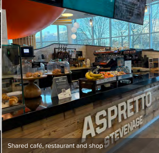
Shared café, restaurant and shop