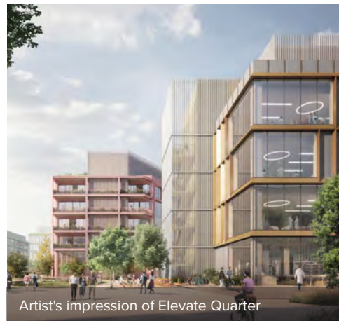
Artist's impression of Elevate Quarter