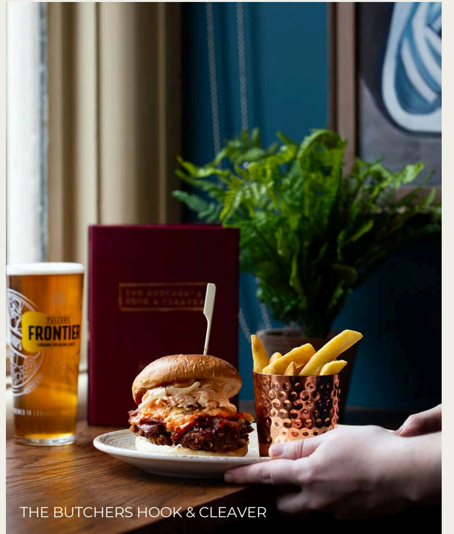
THE BUTCHERS HOOK & CLEAVER