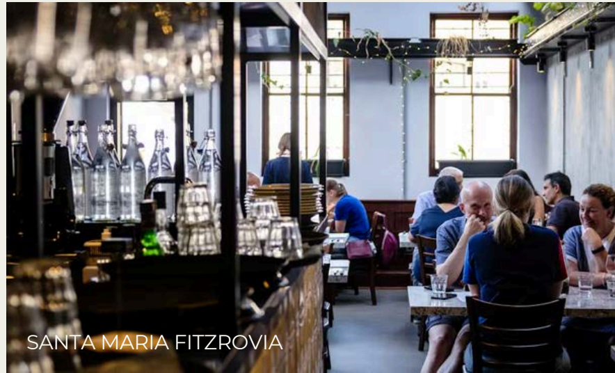
SANTA MARIA FITZROVIA