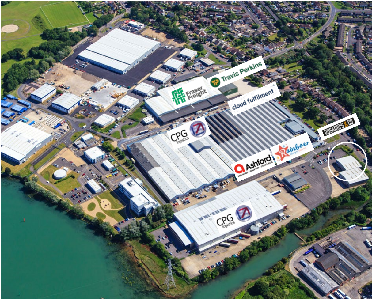
Aerial photograph of Fareham Reach Business Park looking south west.