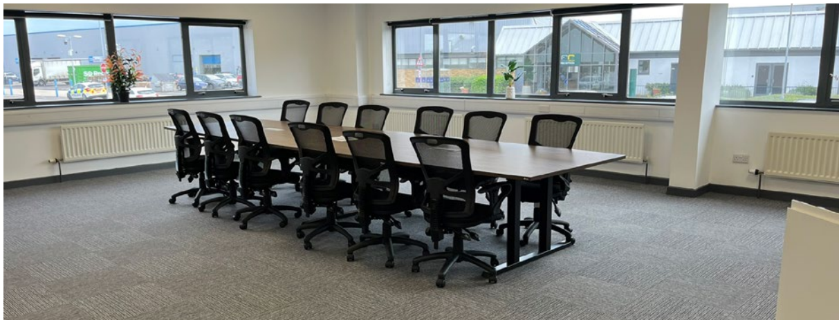
Ground floor office.

Each party to be responsible for their own legal costs incurred in the transaction.