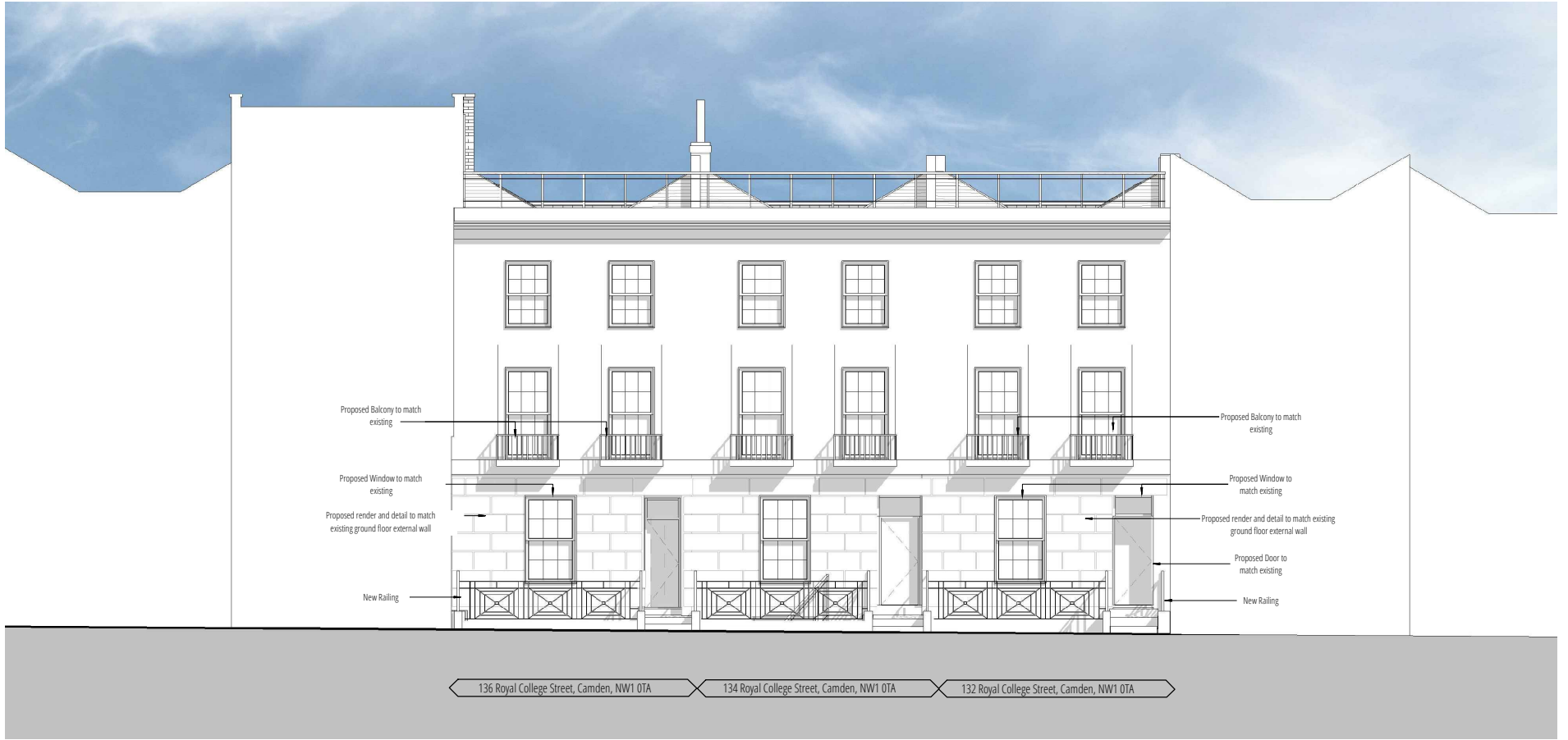
1 Proposed Front Elevation 1 : 100

NOTES: 1. THIS DRAWING IS COPYRIGHT AND MUST NOT BE REPRODUCED IN WHOLE OR IN PART WITHOUT WRITTEN PERMISSION OF GAA DESIGN. 2. THIS DRAWING REPRESENTS DESIGN INTENT AND CONCEPT ONLY. HENCE IT CAN BE SCALED FOR PLANNING PURPOSES ONLY. 3. THIS DOCUMENT AND ALL ASSOCIATED DOCUMENTS ARE PREPARED FOR SPECIFIC SITE AND SCHEME AND INCORPORATE CALCULATIONS AND ASSUMPTIONS AVAILABLE FROM THE CLIENT AT THE TIME OF DRAFTING. 4. THE RECEIPIENT AGREES TO PROTECT THE CONTENTS FROM DISTRIBUTION AND DISSEMINATION EXCEPT AS REQUIRED FOR THE SPECIFIC CLIENT NAMED, WITHOUT THE WRITTEN PERMISSION OF THE DESIGNER. 5. USE OF THIS DESIGN IS GRANTED TO THE CLIENT FOR THE SPECIFIC AND NAMED EVENT ONLY. COPYRIGHT © 2019