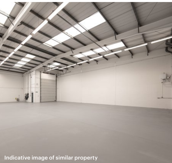
Indicative image of similar property