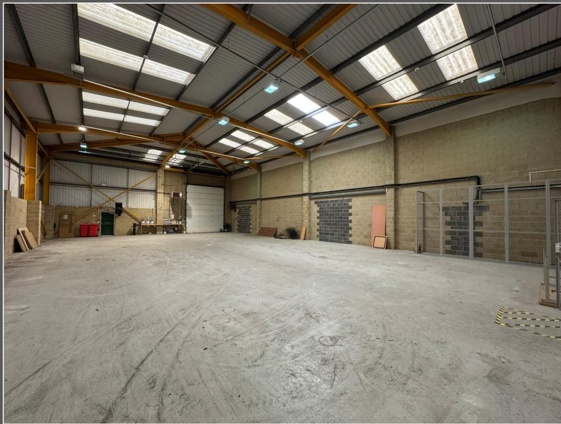
Images taken prior to refurbishment