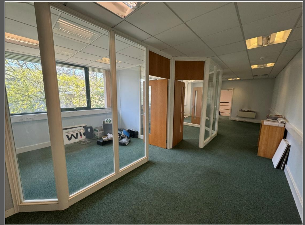
Images taken prior to refurbishment