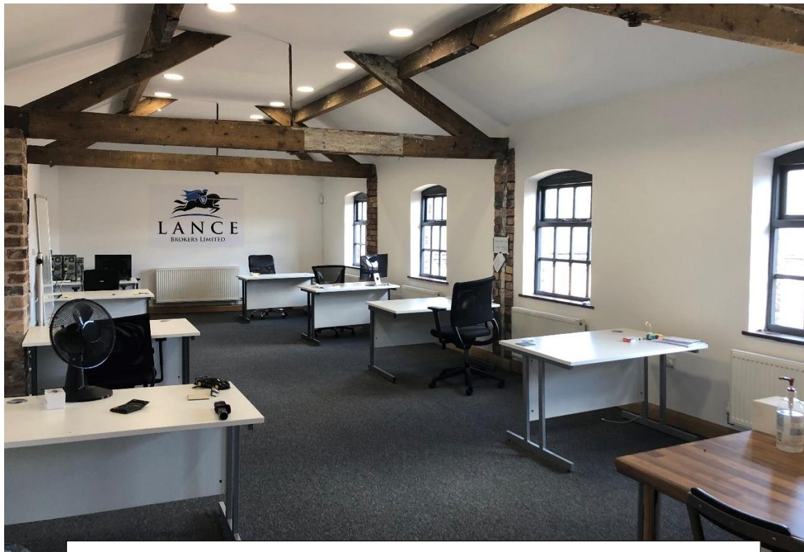
Photos indicative as of 2022 as the property is subject to refurbishment & office equipment has been removed

SUITE 6A PHOENIX WORKS, 500 KING STREET, LONGTON, STOKE-ON-TRENT, ST3 1EZ