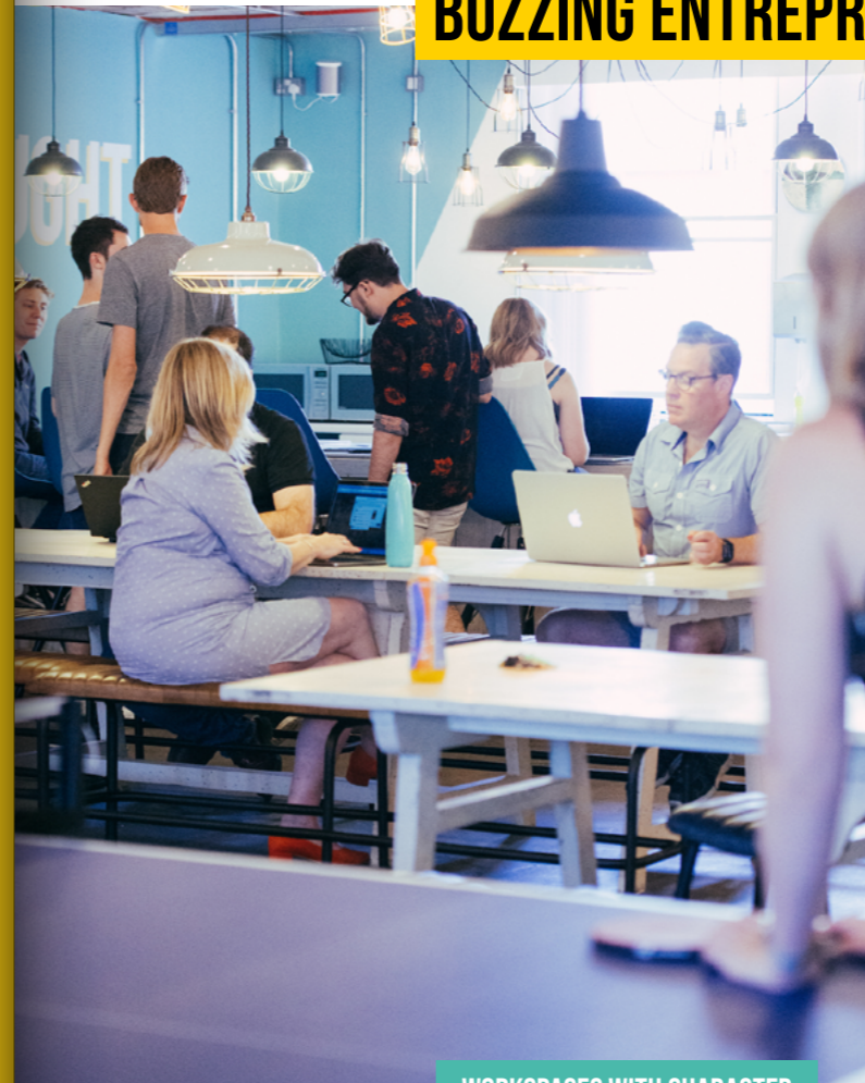
WORKSPACES WITH CHARACTER

FUEL STUDIOS IS A VIBRANT HUB FOR CREATIVE BUSINESSES, AND BUZZING ENTREPRENEURS.