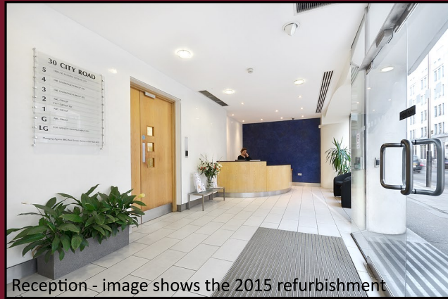
Reception - image shows the 2015 refurbishment