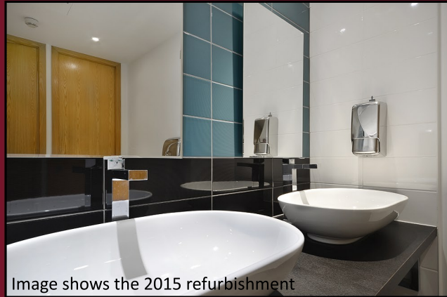
Image shows the 2015 refurbishment