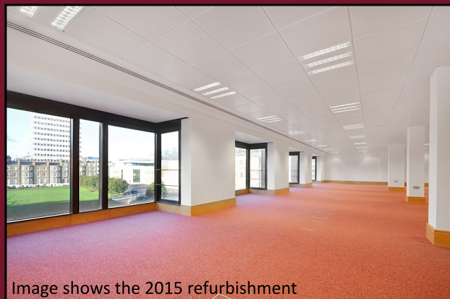
Image shows the 2015 refurbishment

30 City Road is to be upgraded during 2020. The 2nd floor office suite has just been refurbished to provide open plan, redecorated and recarpeted space with a total net floor area of 1950 sq ft.