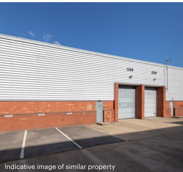
Indicative image of similar property