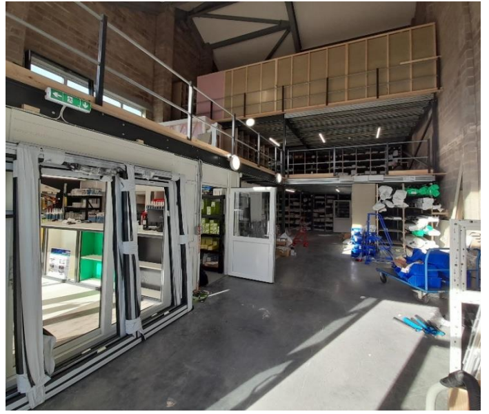
(Unit 1 The Fascia Place)