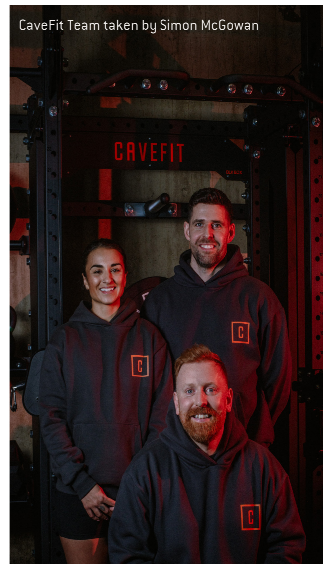
CaveFit Team