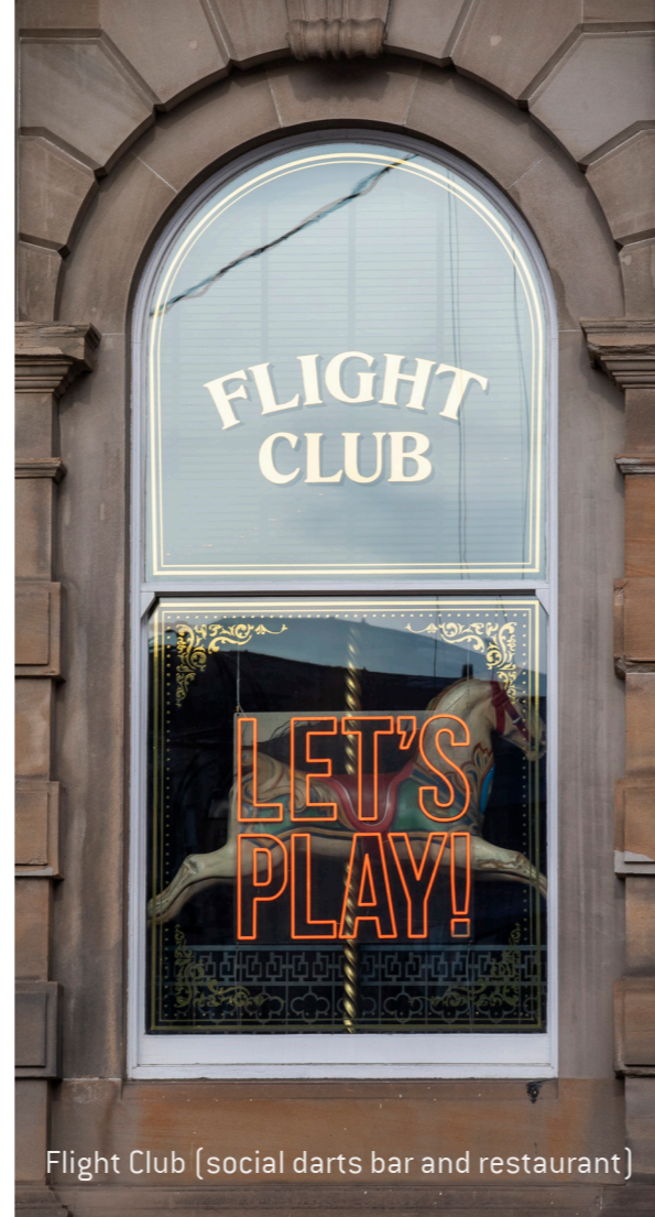
Flight Club (social darts bar and restaurant)

As of April 2026, the team at Waracle Ltd has taken occupancy of two floors at 4 Love Loan, establishing the building as their new city-centre headquarters.