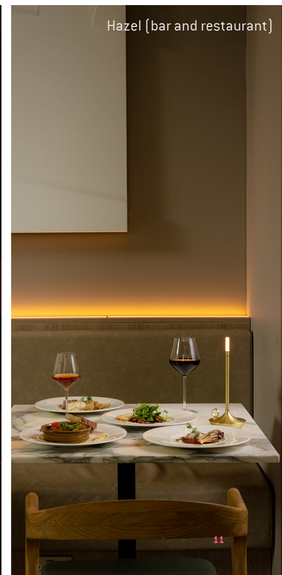
Hazel (bar and restaurant)