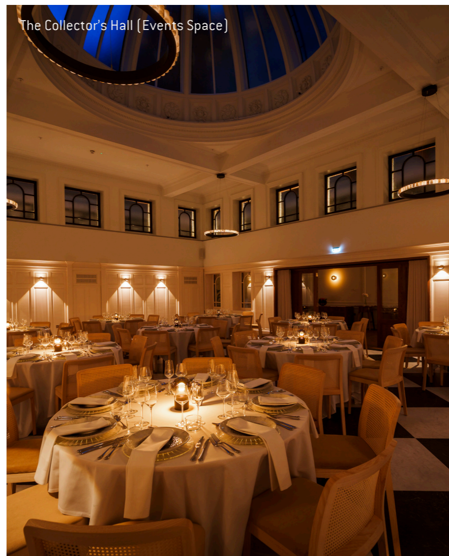
The Collector's Hall (Events Space)