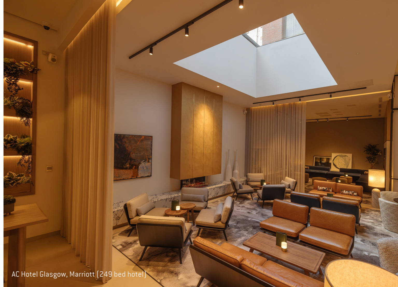
AC Hotel Glasgow, Marriott (249 bed hotel)