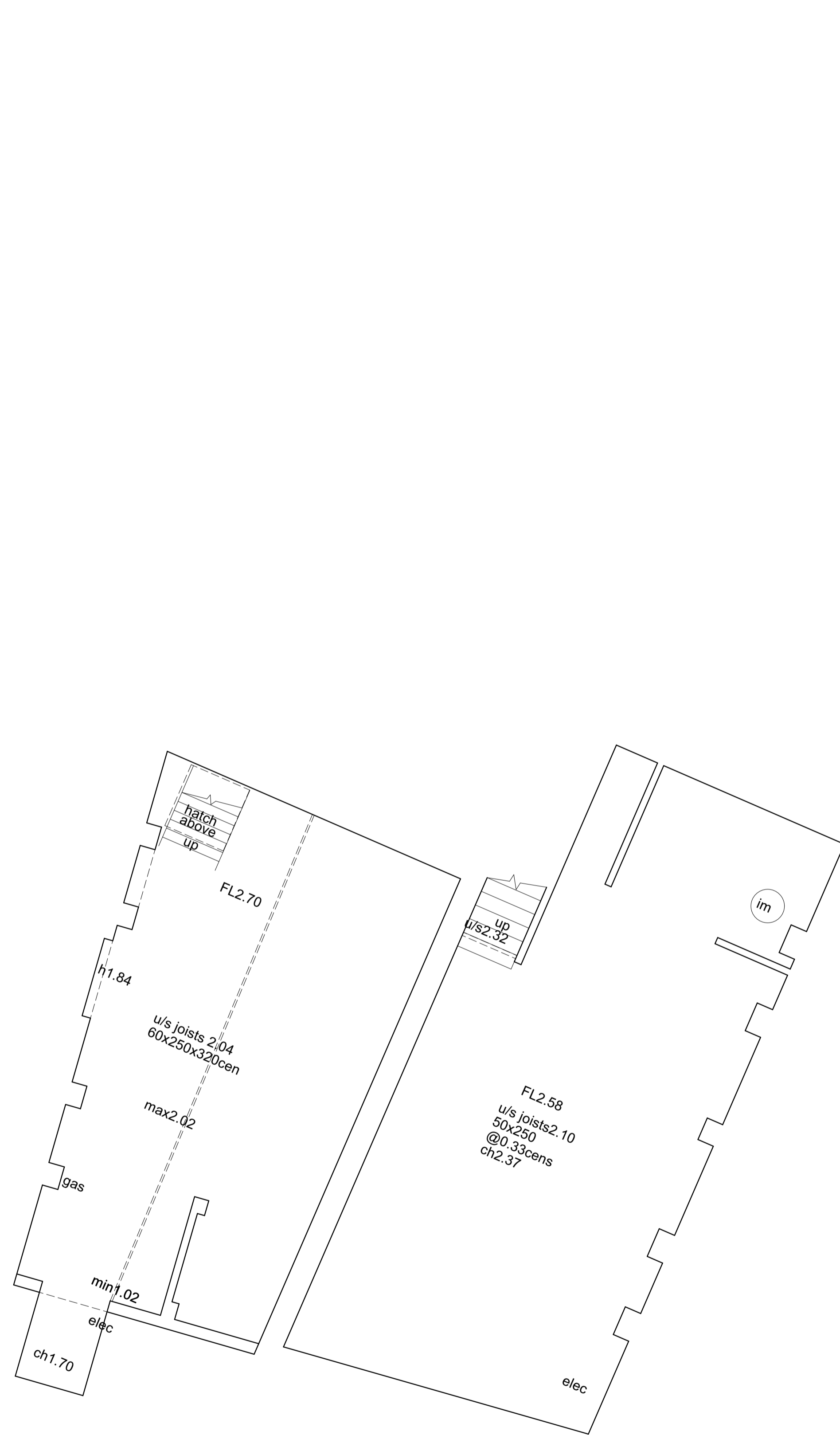
1 EXISTING BASEMENT FLOOR PLAN 1:50