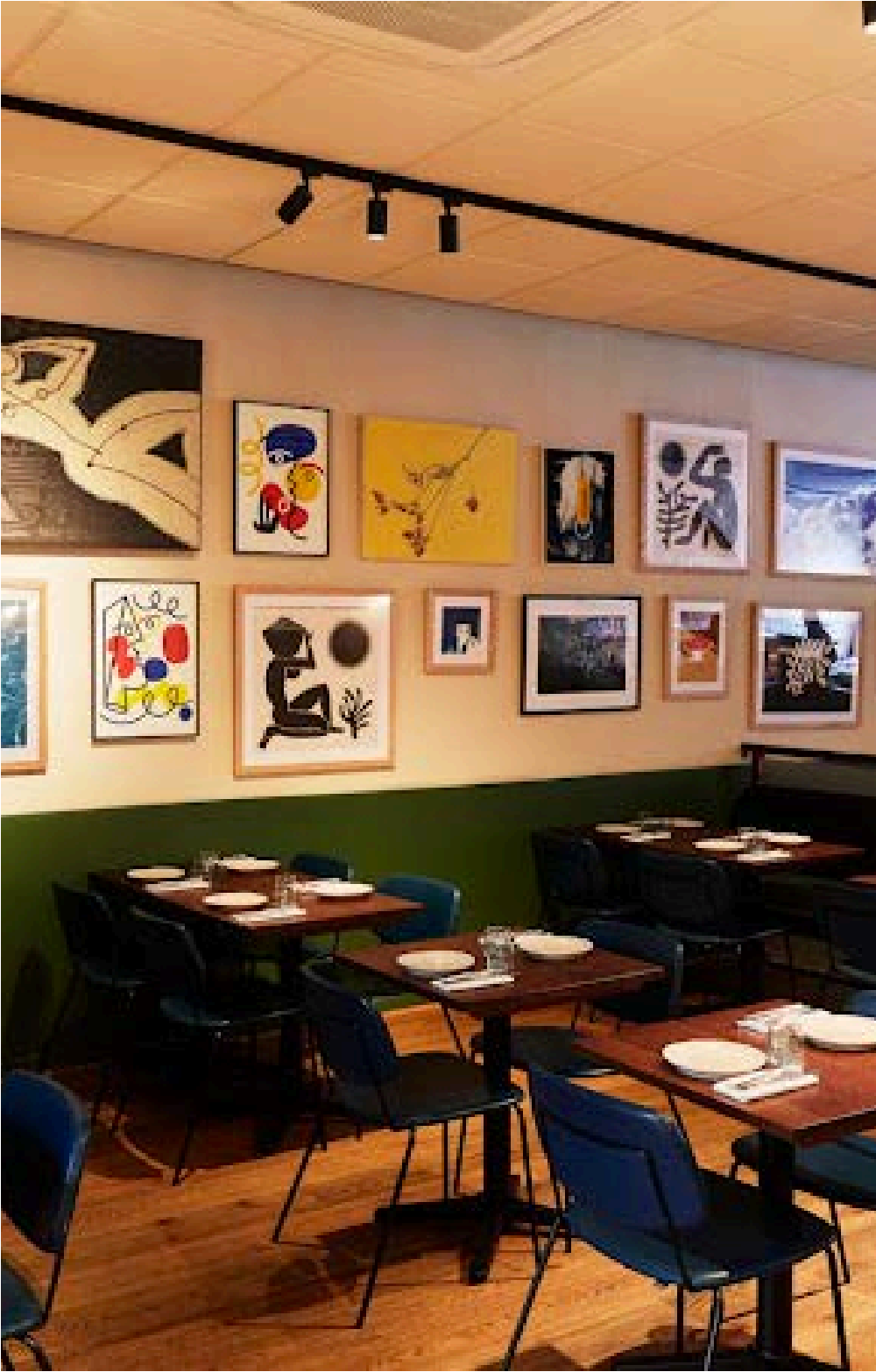
Honey & Smoke