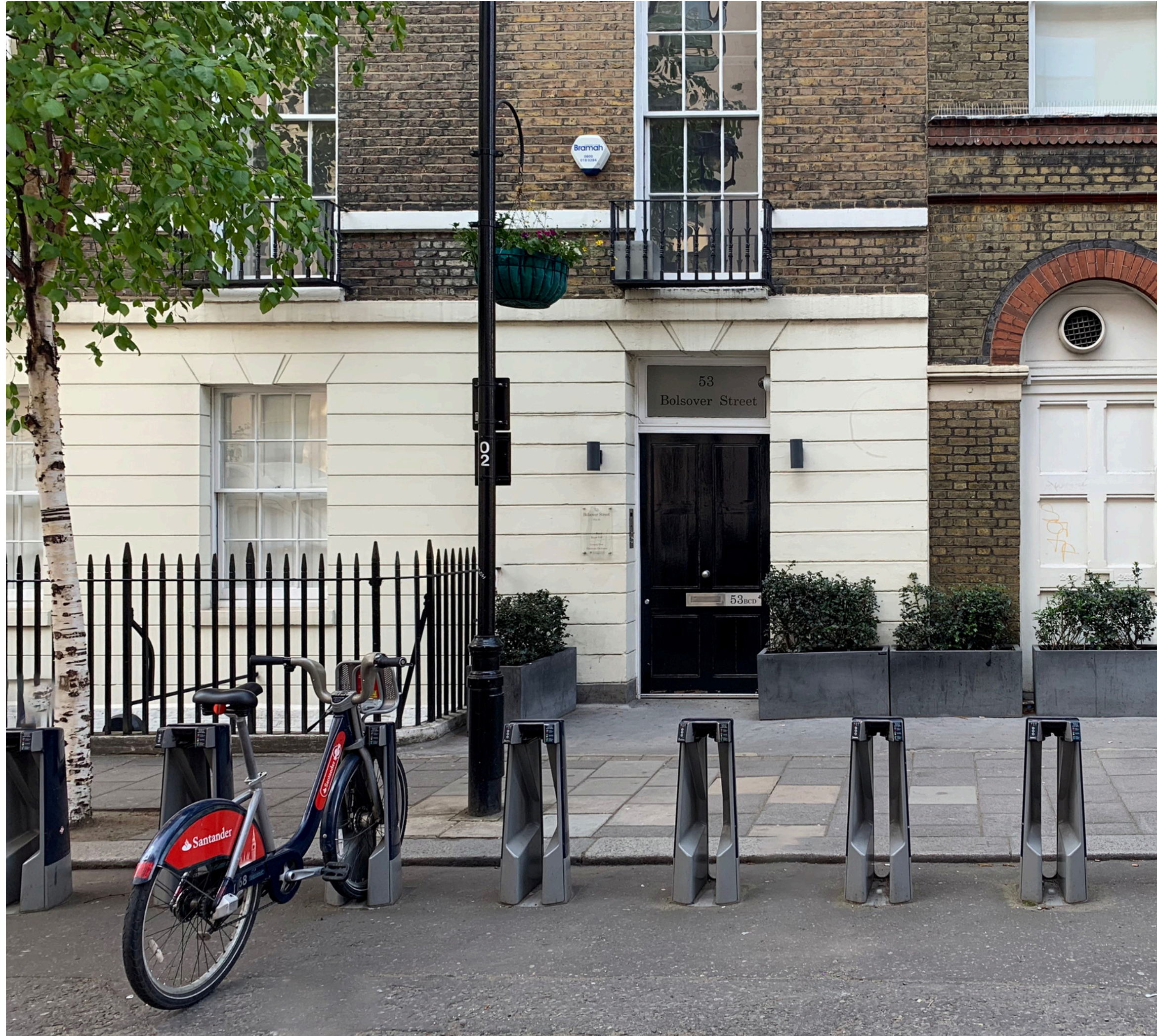
53 BOLSOVER STREET