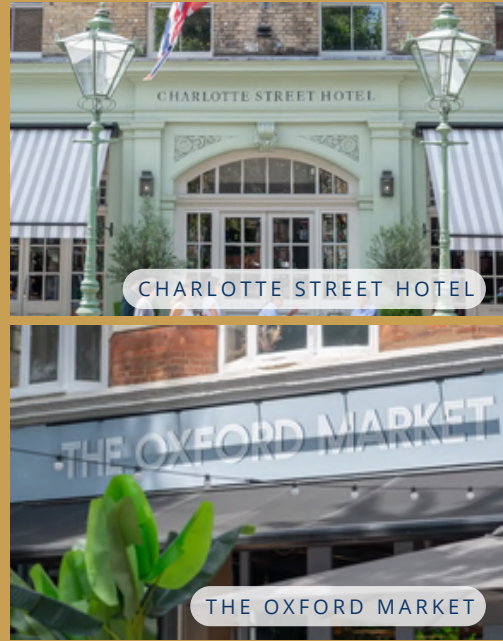
CHARLOTTE STREET HOTEL