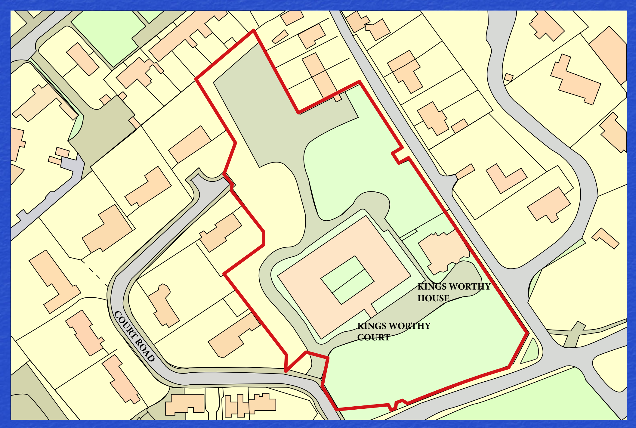
RED OUTLINE INDICATIVE FOR KINGS WORTHY COURT & HOUSE