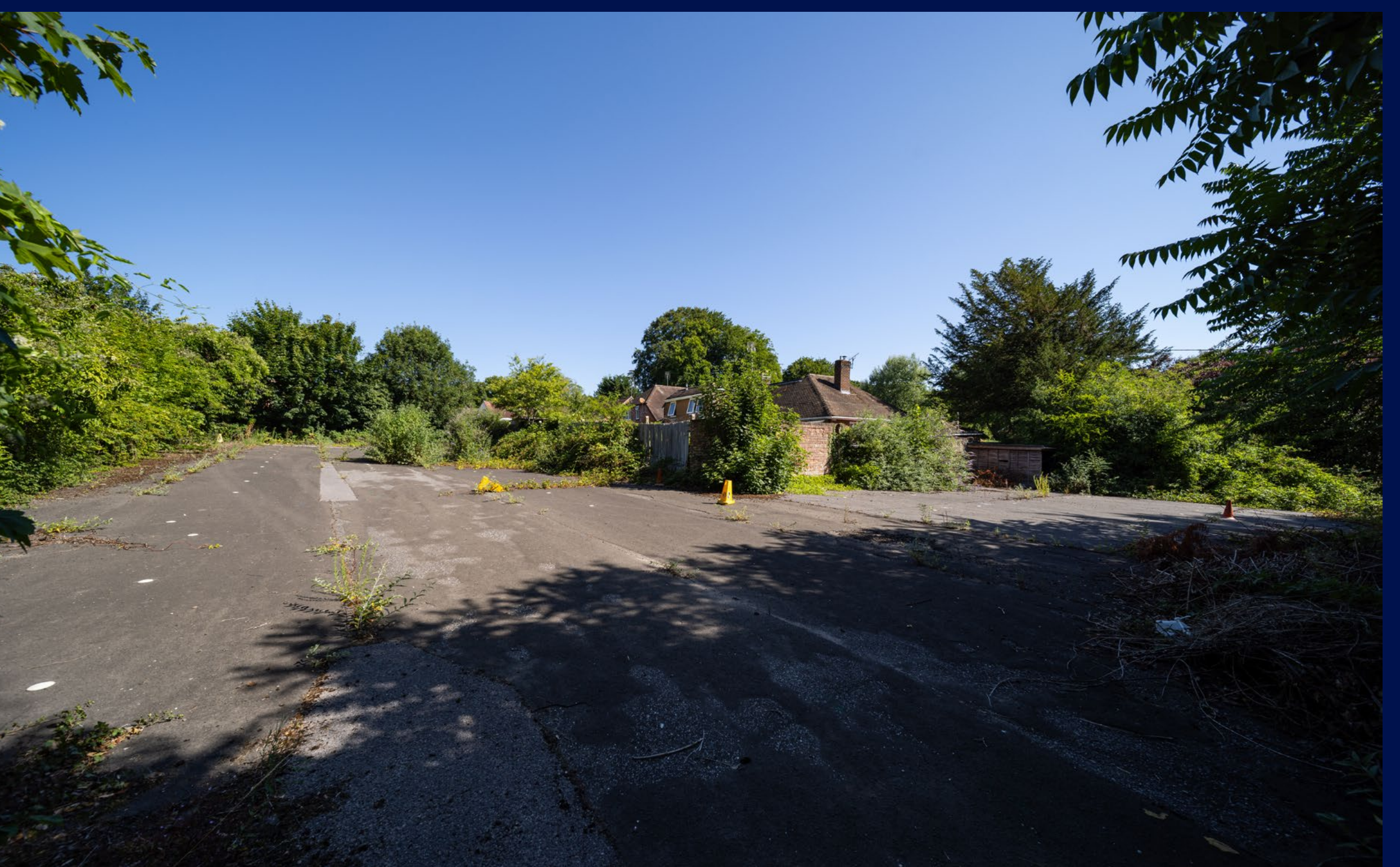
4 - KINGS WORTHY C & H