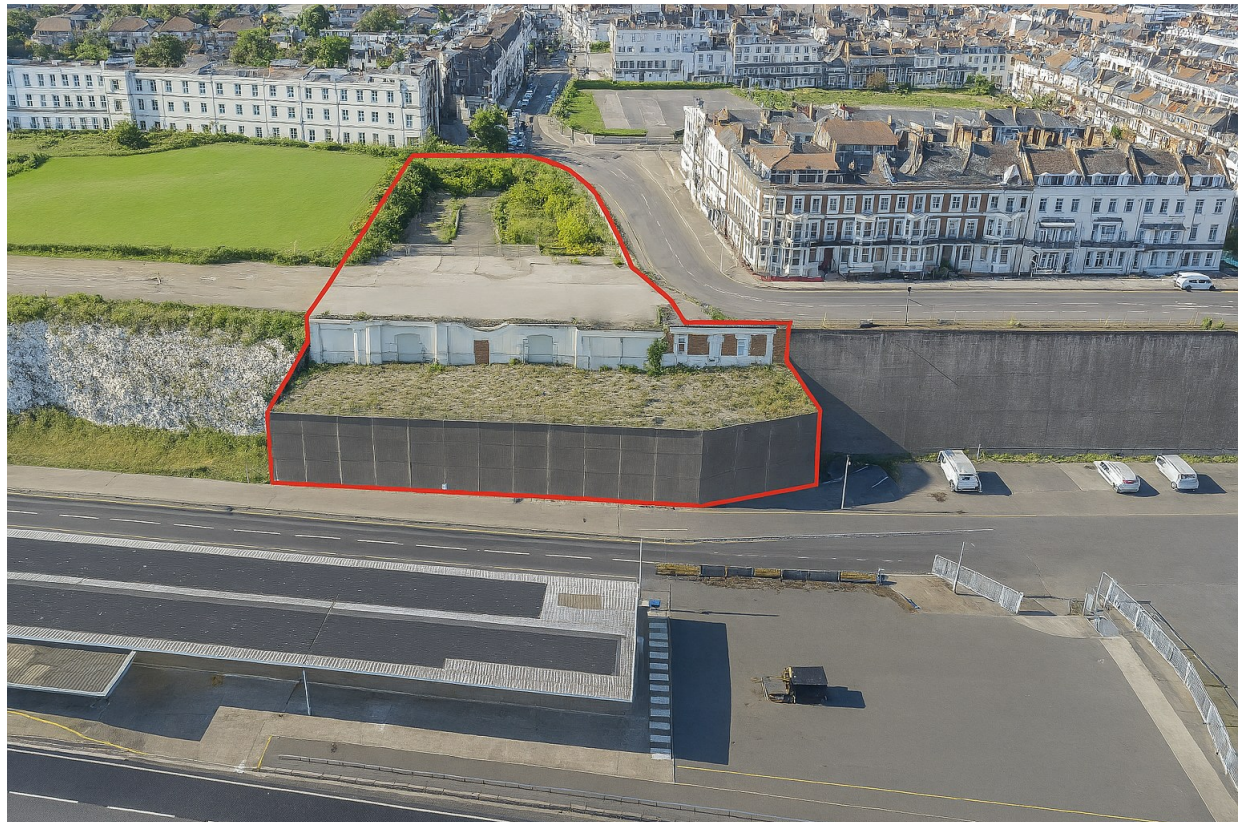
Red line boundary is indicative only