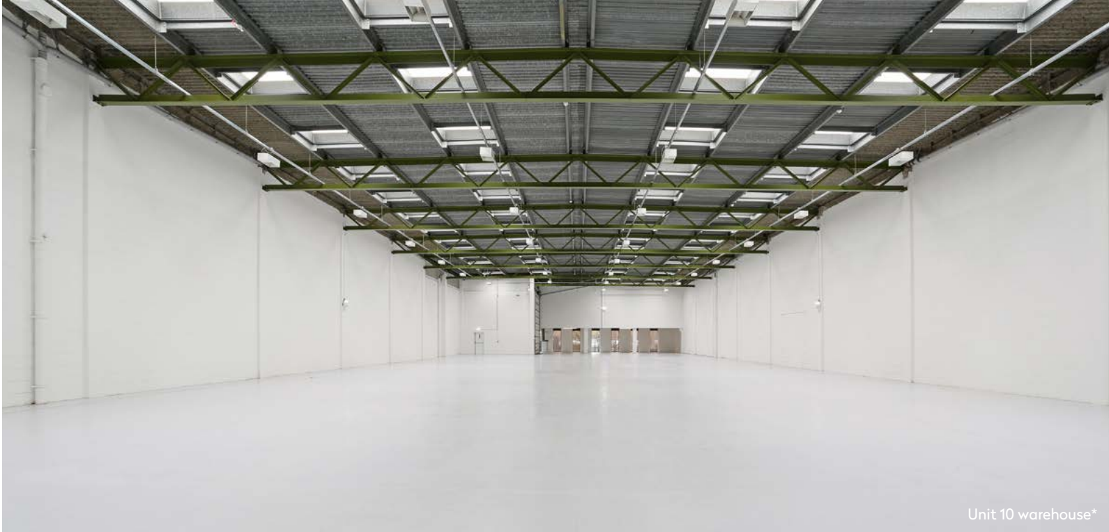
Unit 10 warehouse*