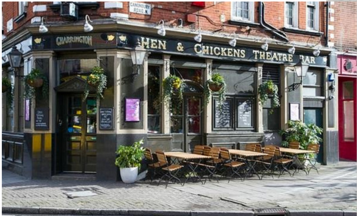
The Hen & Chickens Theatre Bar