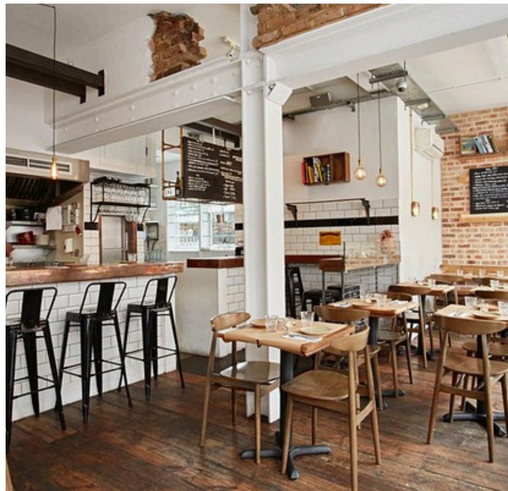
Prawn On The Lawn Islington