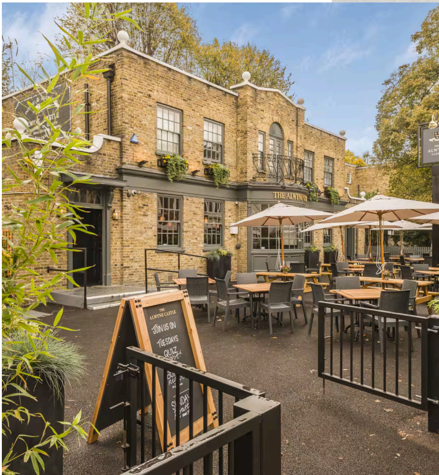
The Alwyne Castle