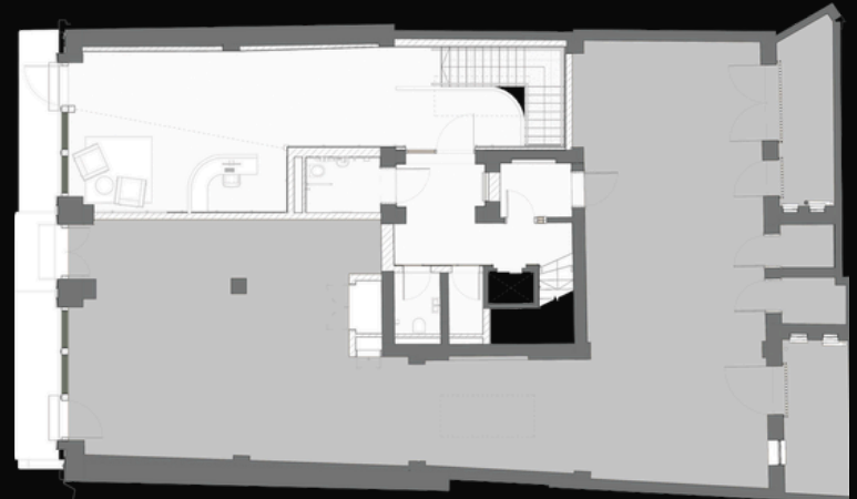
GROUND FLOOR | 1,776 SQFT

Please note there is xxx sq. ft. of newly refurbished state of the art office above. For more information please speak to a member of the team.