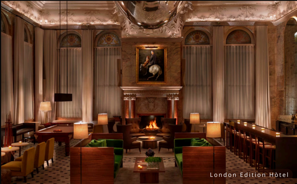
London Edition Hôtel