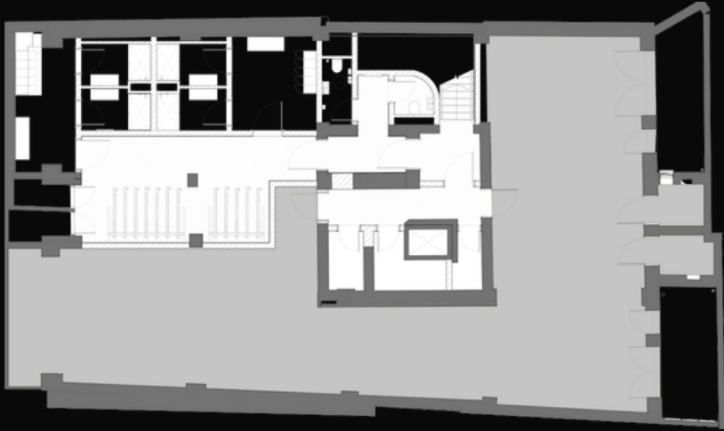
LOWER GROUND FLOOR | 1,636 SQFT