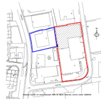
Proposed Site Location Plan 1:1250 on A1

Contractor to check measurements on site. Copyright: Alan J Young Ltd