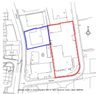
Existing Site Location Plan 1:1250 on A1