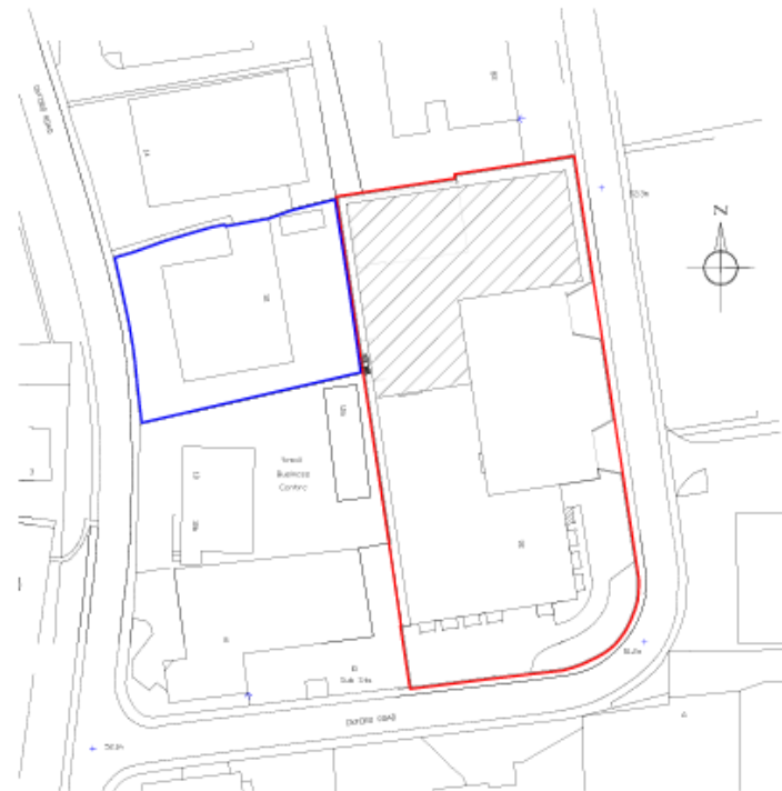
Proposed Block Plan 1:500 on A1