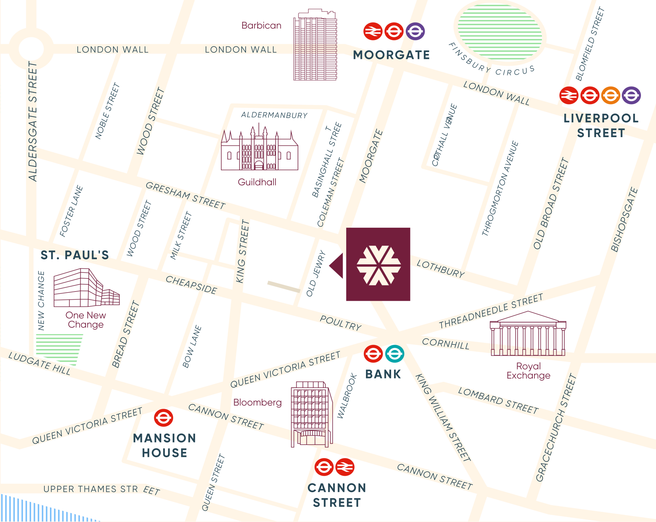
Walk times from the building.