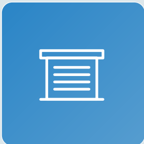
Full height roller shutter door