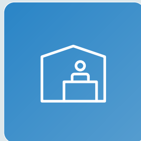
Industrial and trade counter

The available properties comprise individual terraced units of portal frame construction under twin skin sheet metal profiled roofs incorporating translucent lighting panels and cavity brick elevations with loading doors and forecourt parking.