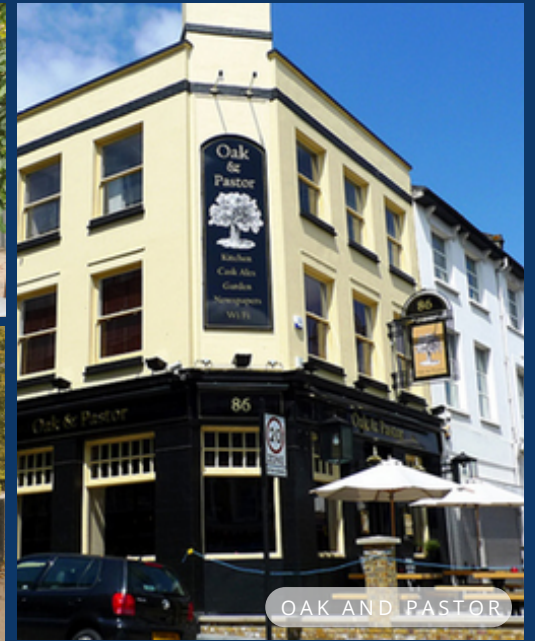
OAK AND PASTOR