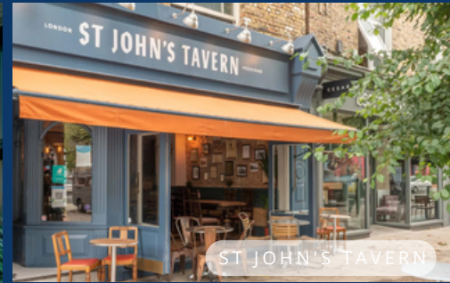
ST JOHN'S TAVERN