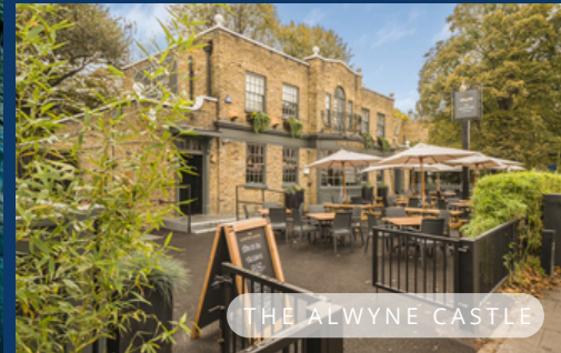
THE ALWYNE CASTLE