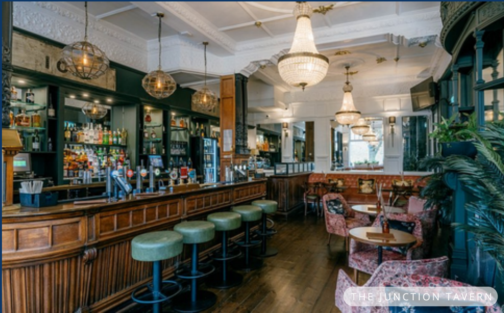
THE JUNCTION TAVERN