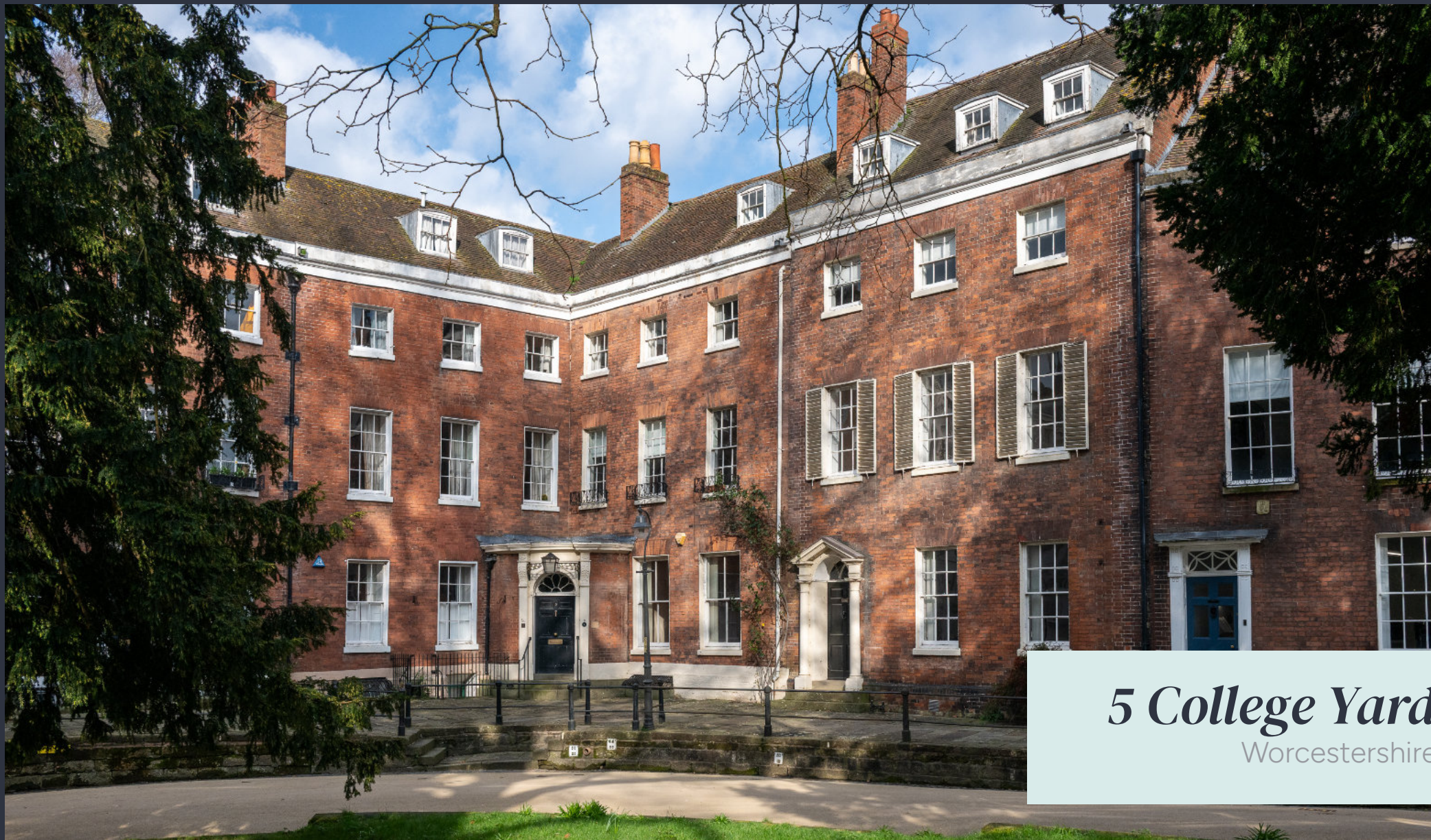
5 College Yard Worcestershire