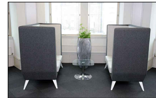
Pod Seating Option 2