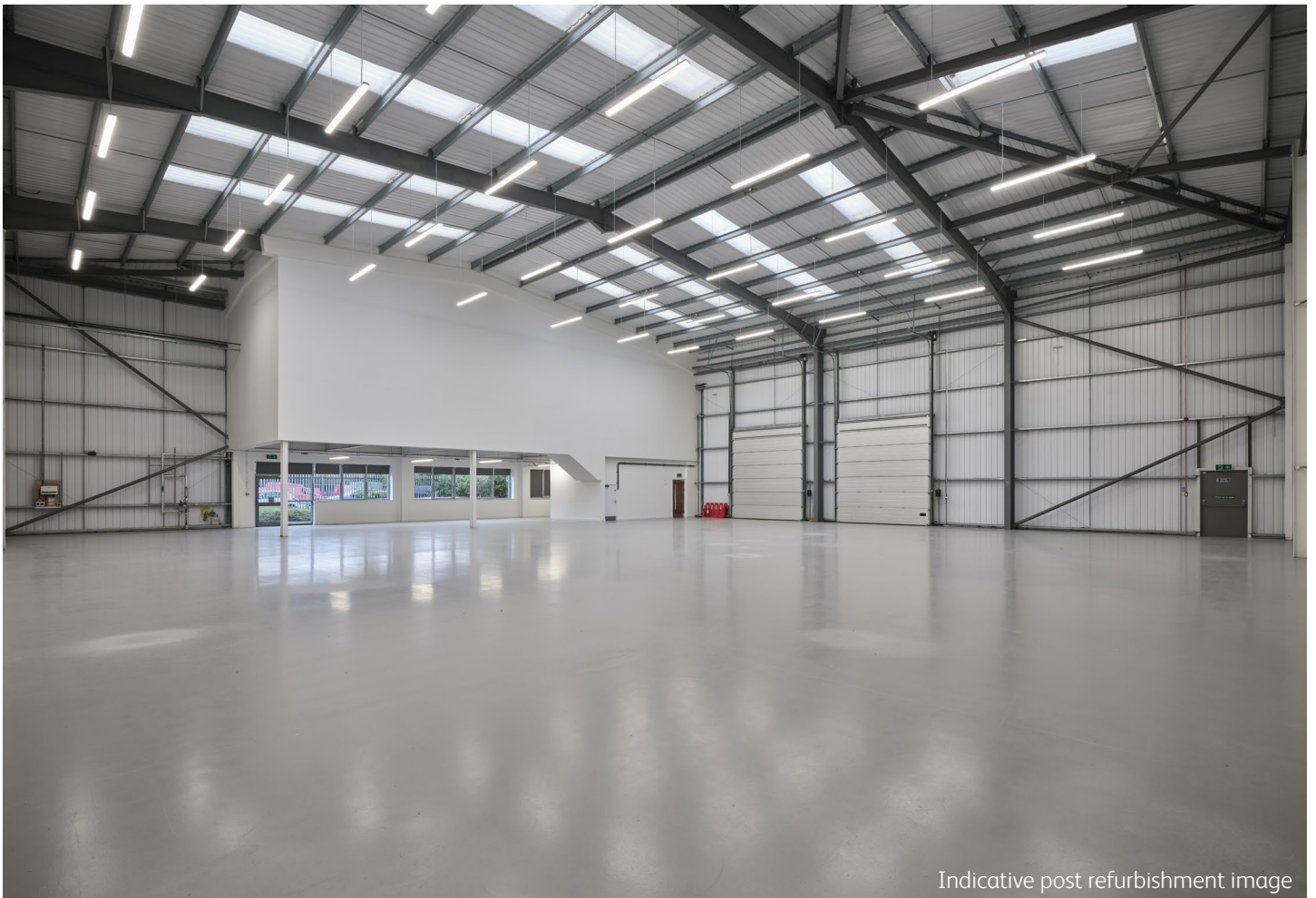
Indicative post refurbishment image

To be refurbished, high specification, detached, warehouse unit designed to meet the needs of modern businesses. The unit benefits from fully fitted first floor offices, the ability to fit out the undercroft to provide additional office space, two electric loading doors and generous car parking provision, including EV charging.