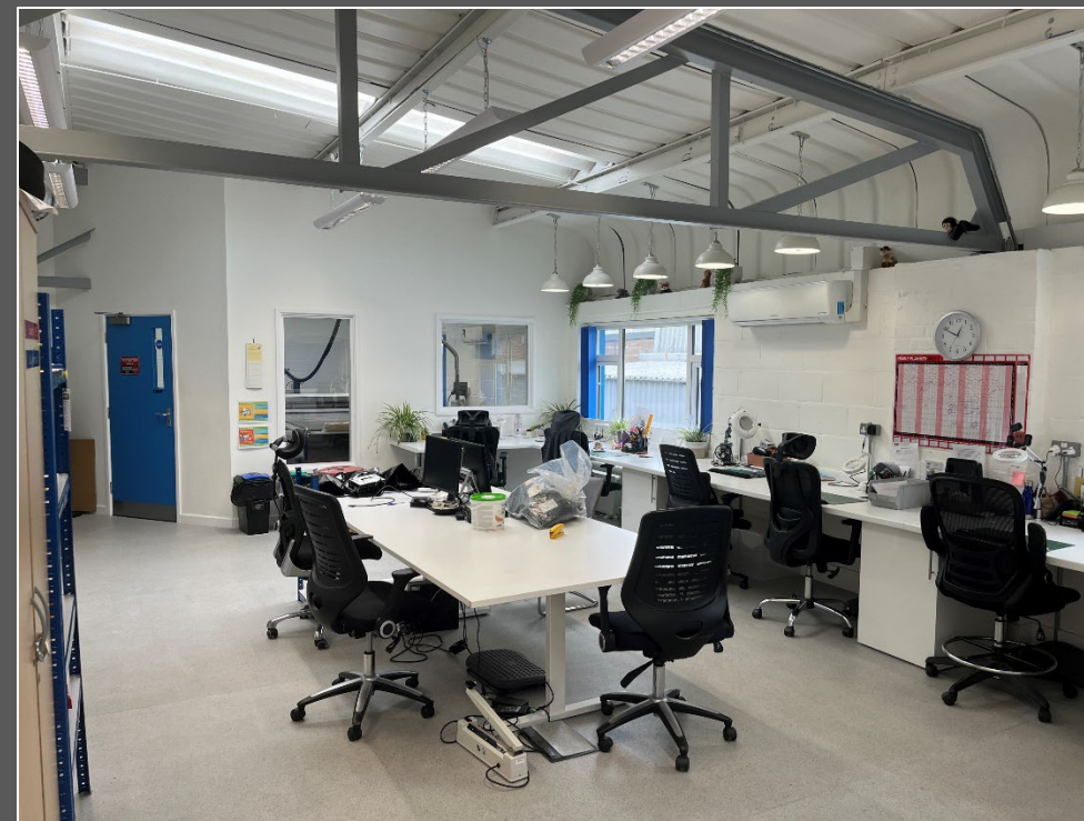
First floor offices and workspace