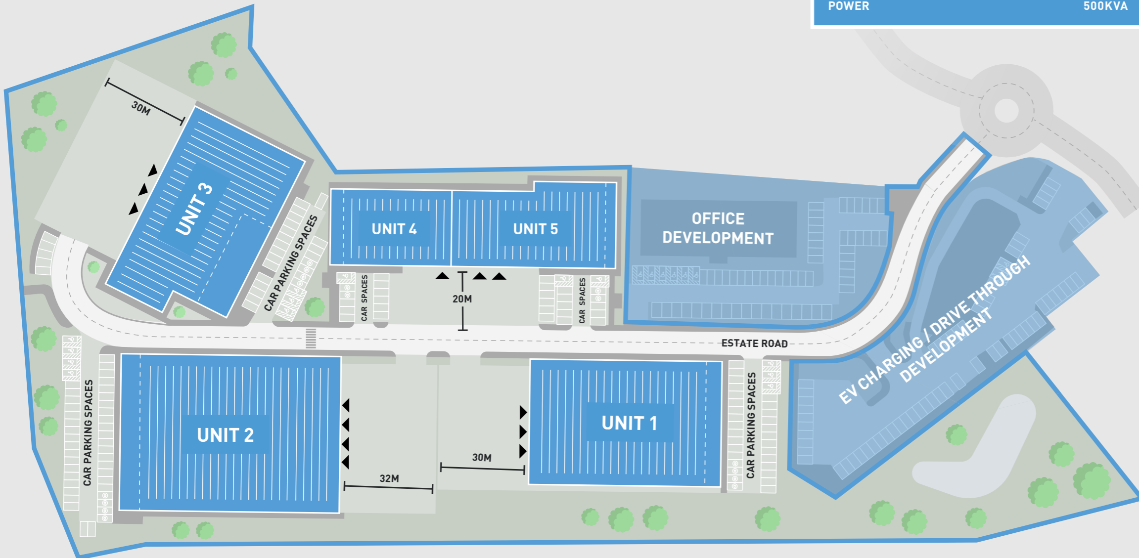
GROSS EXTERNAL FLOOR AREAS