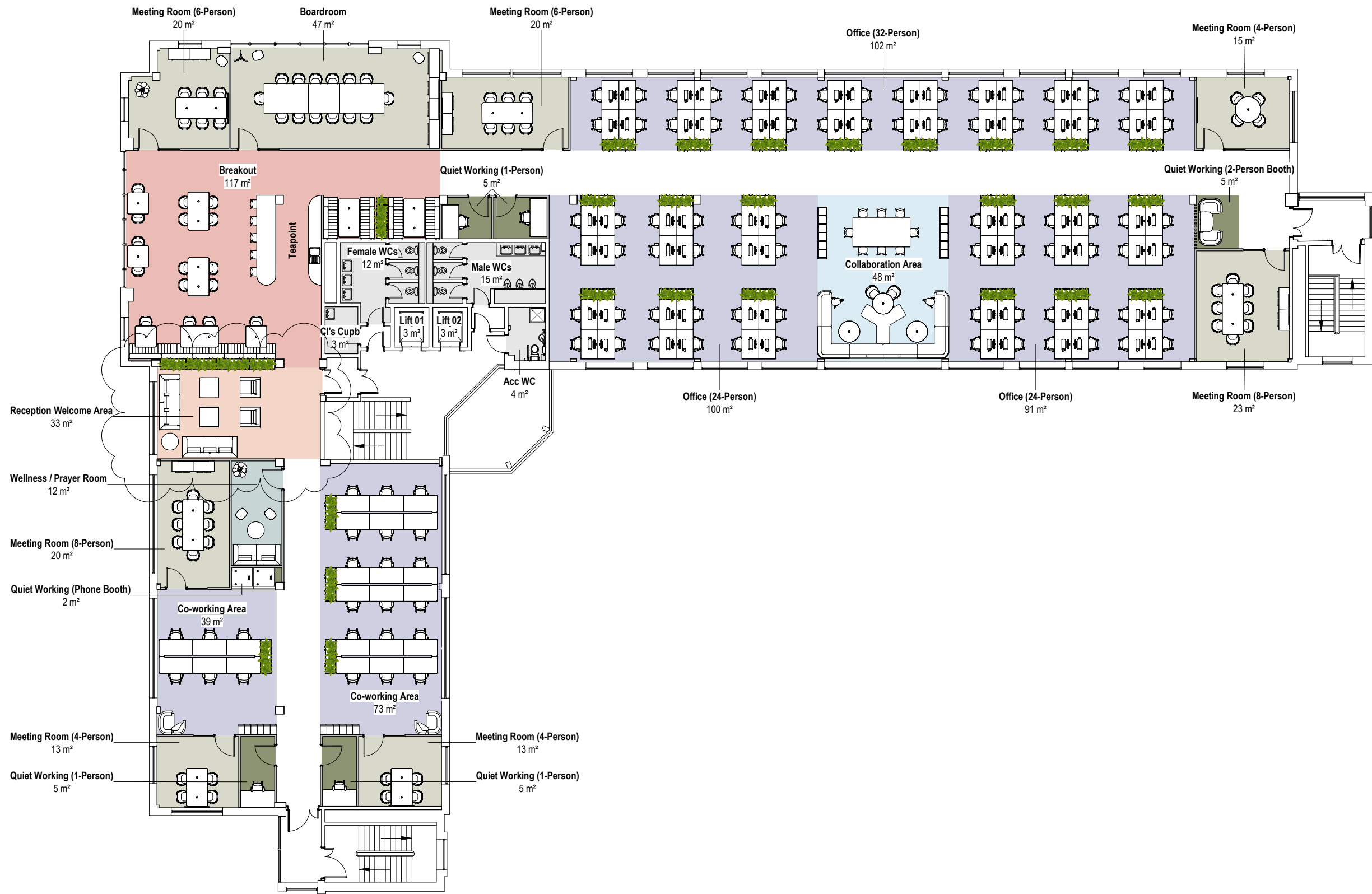
Typical Office Layout Test Fit (Low Density - 80 Permanent Desks) 1 : 200