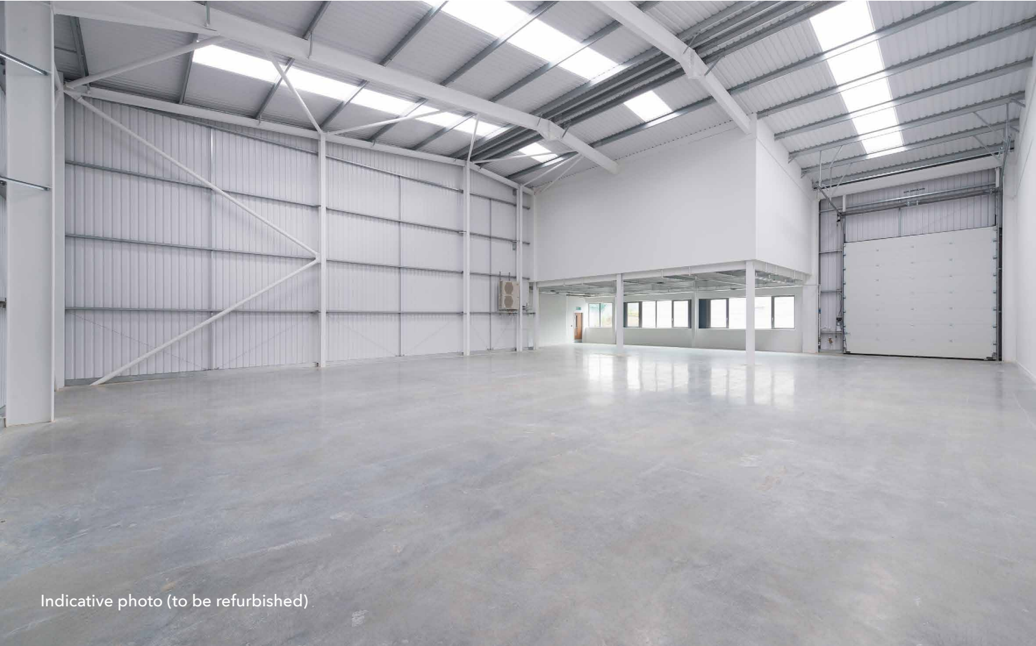
Indicative photo (to be refurbished)