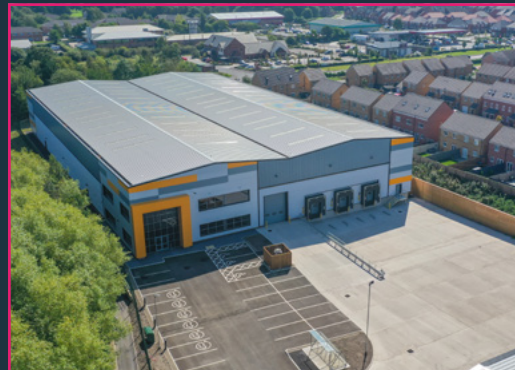
NORTHSIDE 45 Junction 8 M53, Ellesmere Port