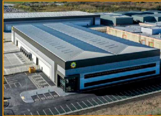
AIR 66 & 84 Owen Drive, Speke