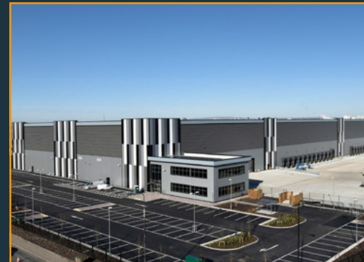
UNION SQUARE Fifth Avenue, Trafford Park, Manchester M17 1DS