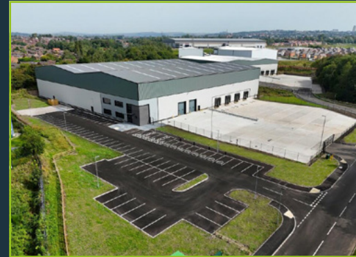
COBALT PARK Oldham Broadway Business Park Chadderton