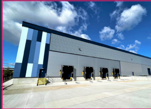
HURRICANE 52 Estuary Business Park, Liverpool