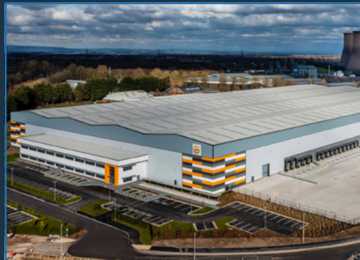
GORSEY POINT Gorsey Lane, Widnes