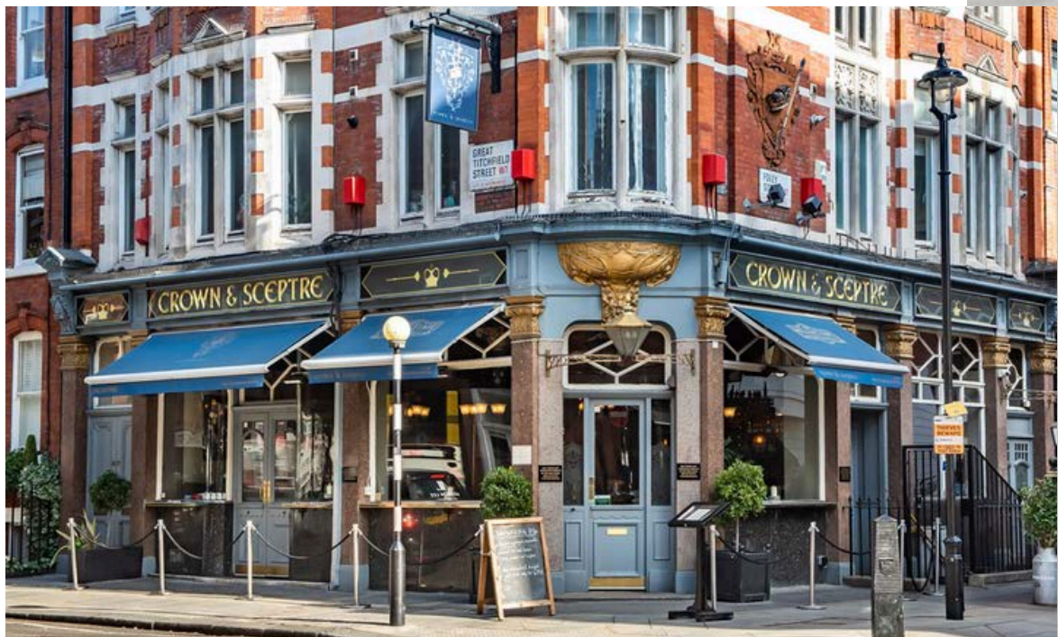
Crown & Sceptre Pub