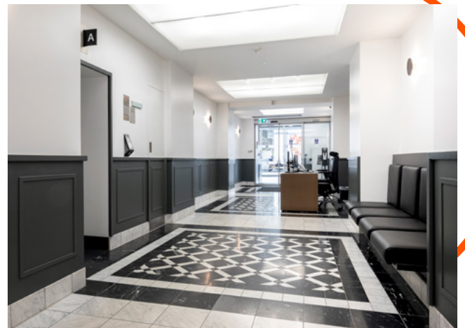
Main building reception area