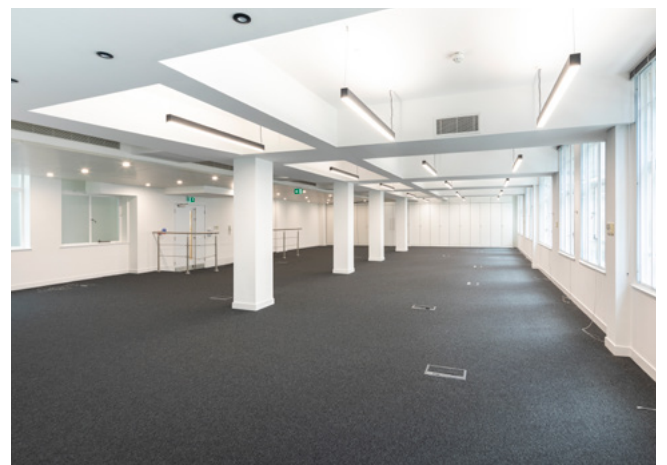
2nd floor CAT A