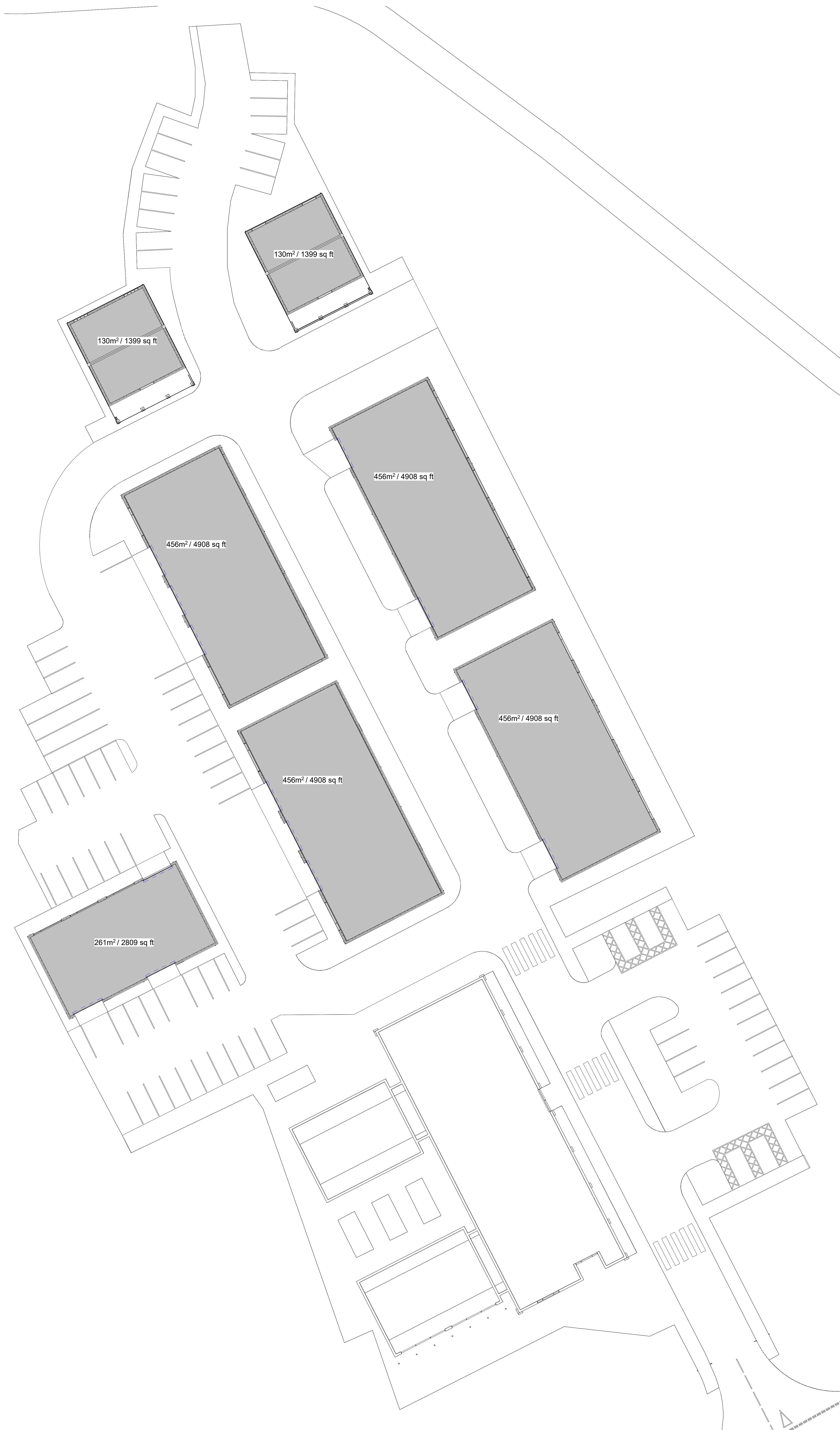
Site Plan Layout