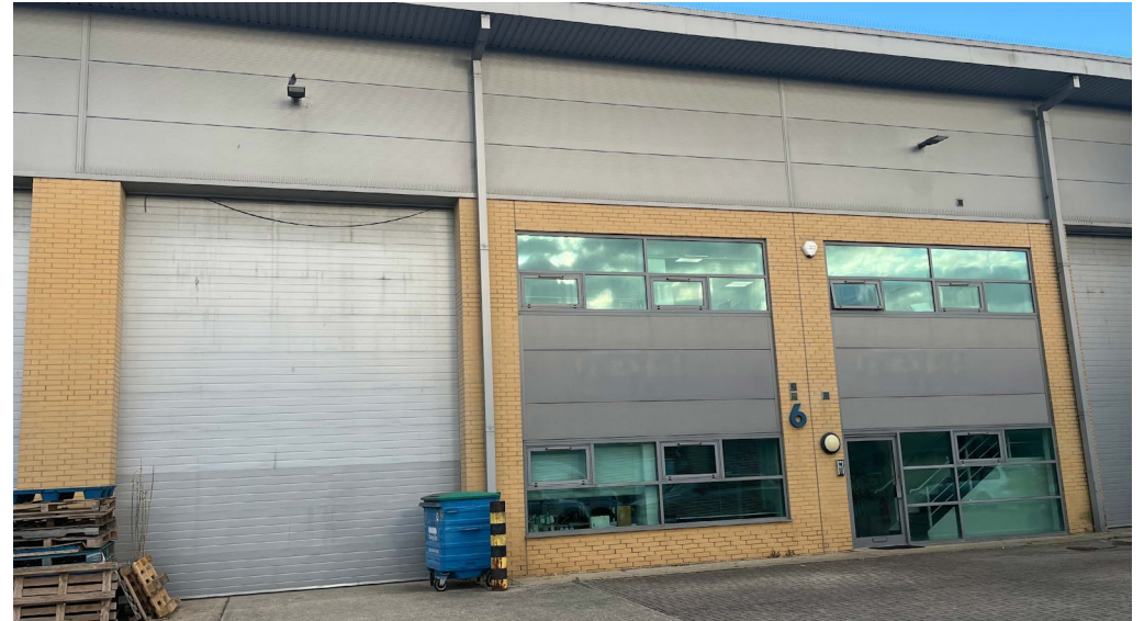
Frontal View from Yard