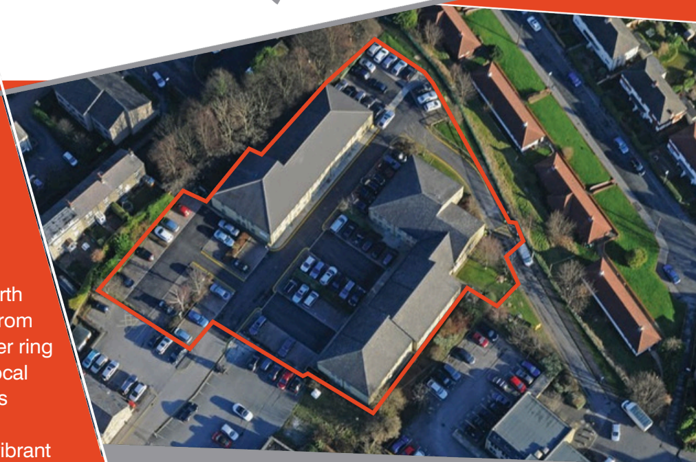
Feast Field - Horsforth - Leeds - LS18 4TJ

Feast Field is situated in Horsforth, 5 miles north west of Leeds City Centre. The area benefits from excellent road and rail links via the A6120 outer ring road and Horsforth Station. A wide range of local amenities including shops, banks, a Morrisons supermarket, and numerous pubs, cafés and restaurants are on the doorstep, providing a vibrant and convenient setting for occupiers.