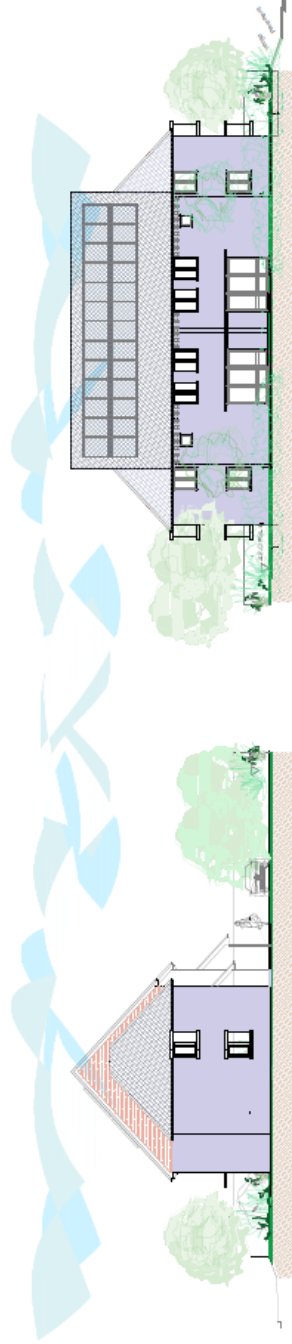
READING ROAD (SOUTH) ELEVATION