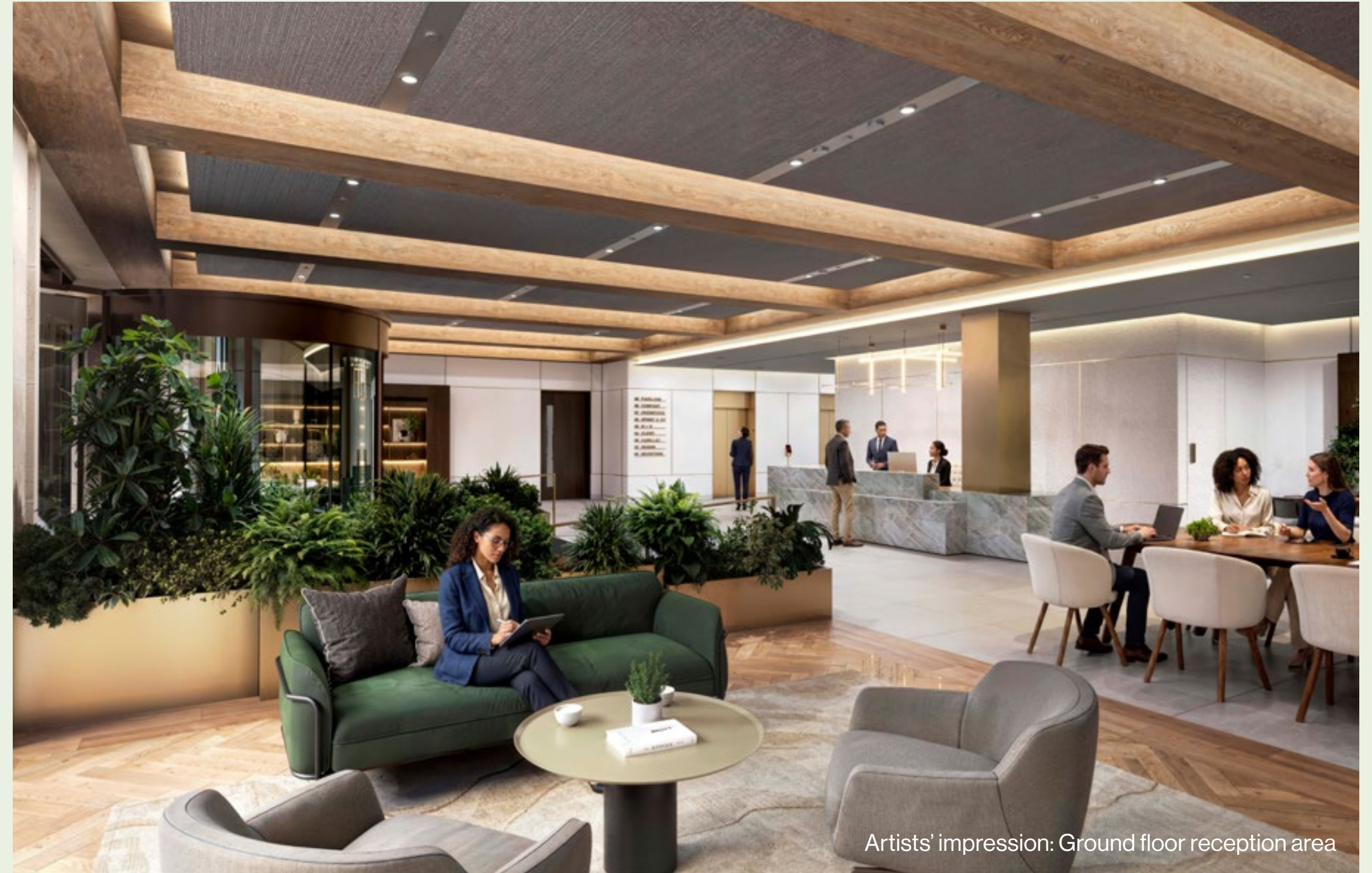
Artists' impression: Ground floor reception area