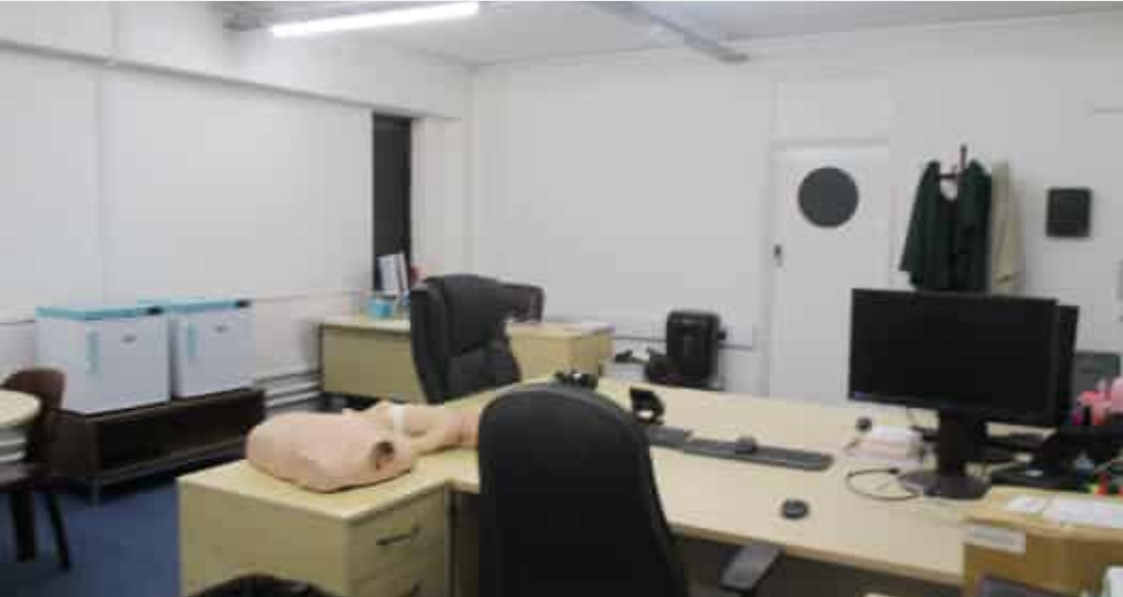
Ground Floor Cussons House