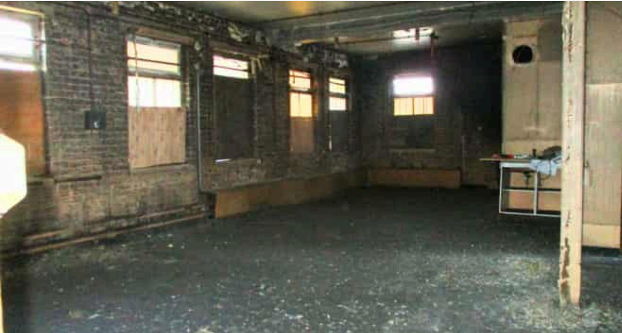
First Floor North Mill