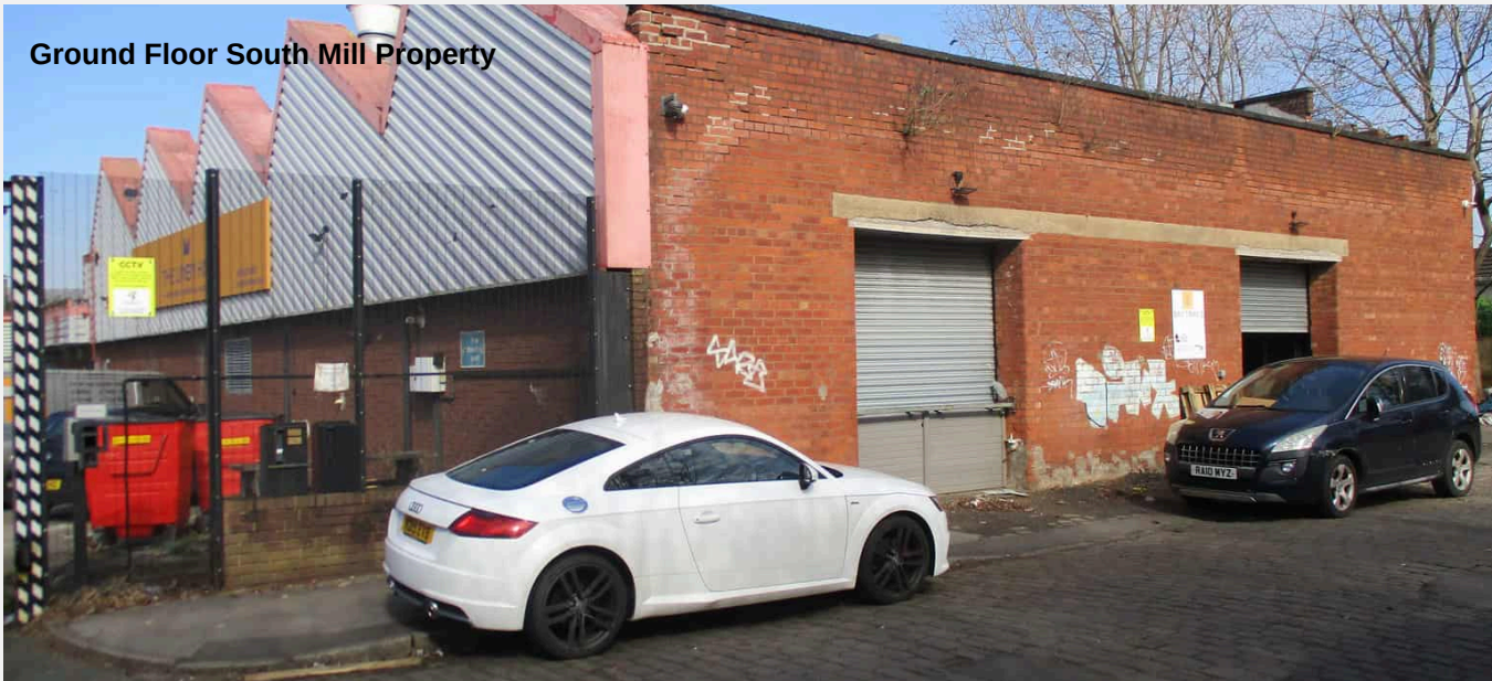
Ground Floor South Mill Property