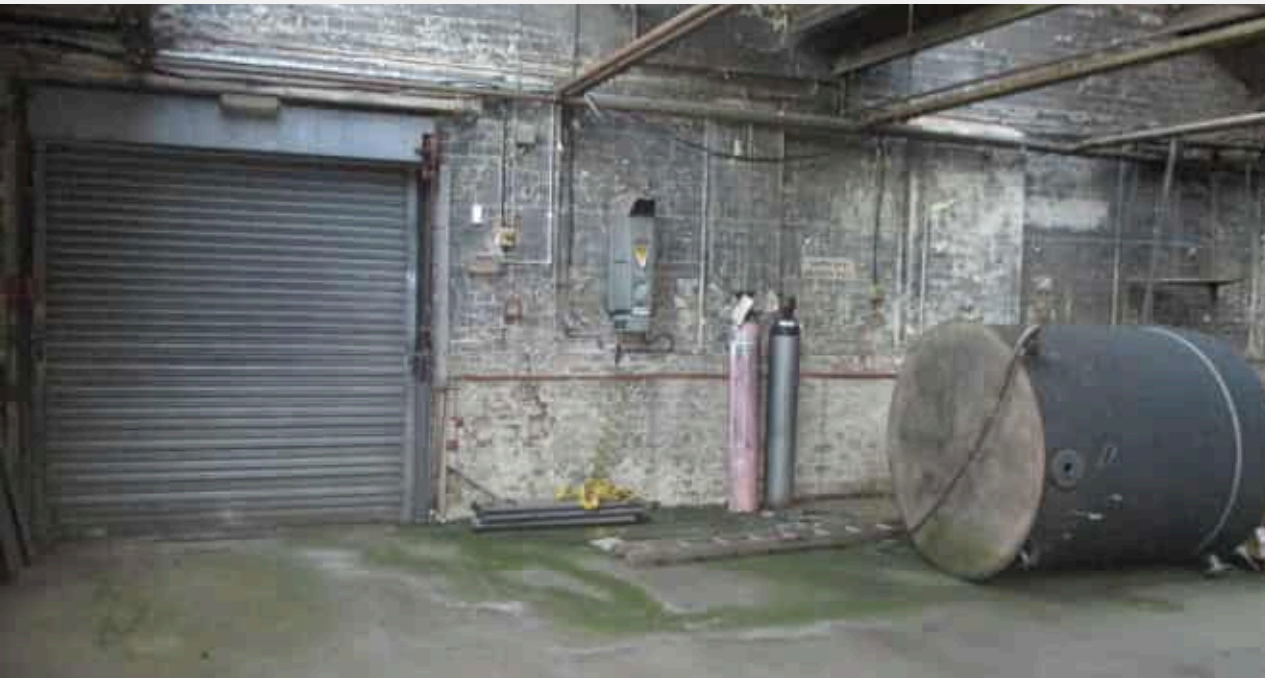
Ground Floor Loading Area