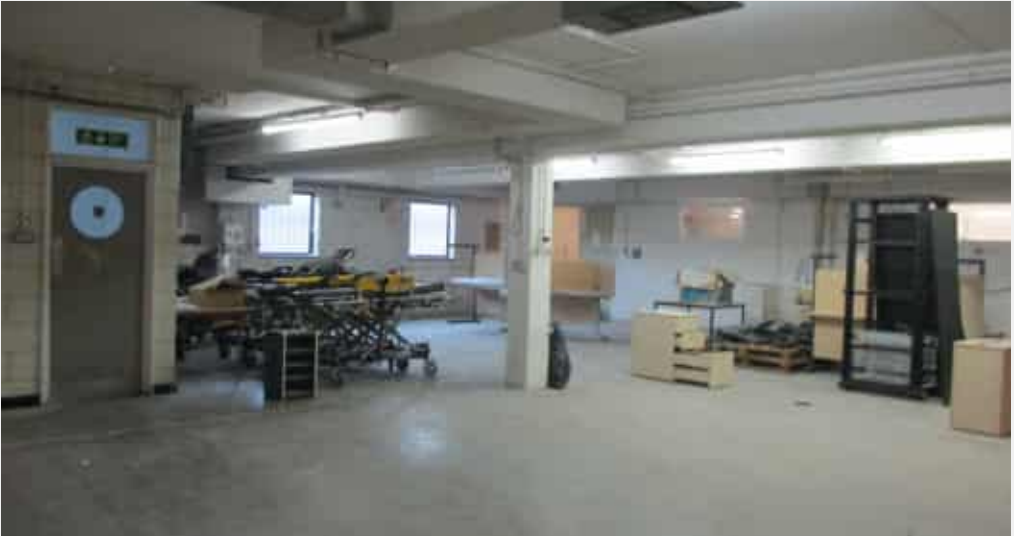
First Floor Cussons House