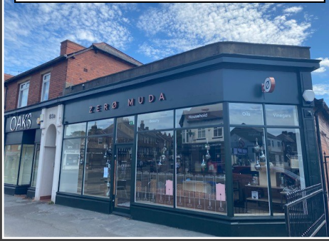
Zero Muda—Re-fill store with zero waste