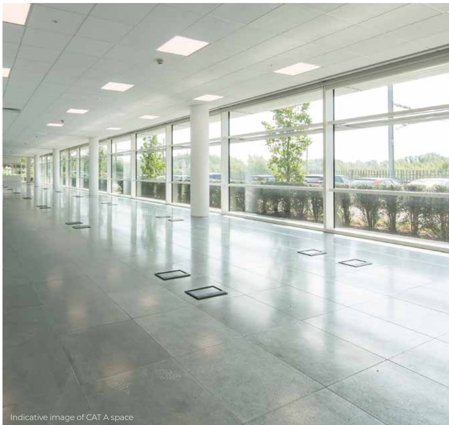
Indicative image of CAT A space