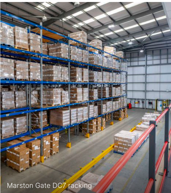
Marston Gate DC7 racking