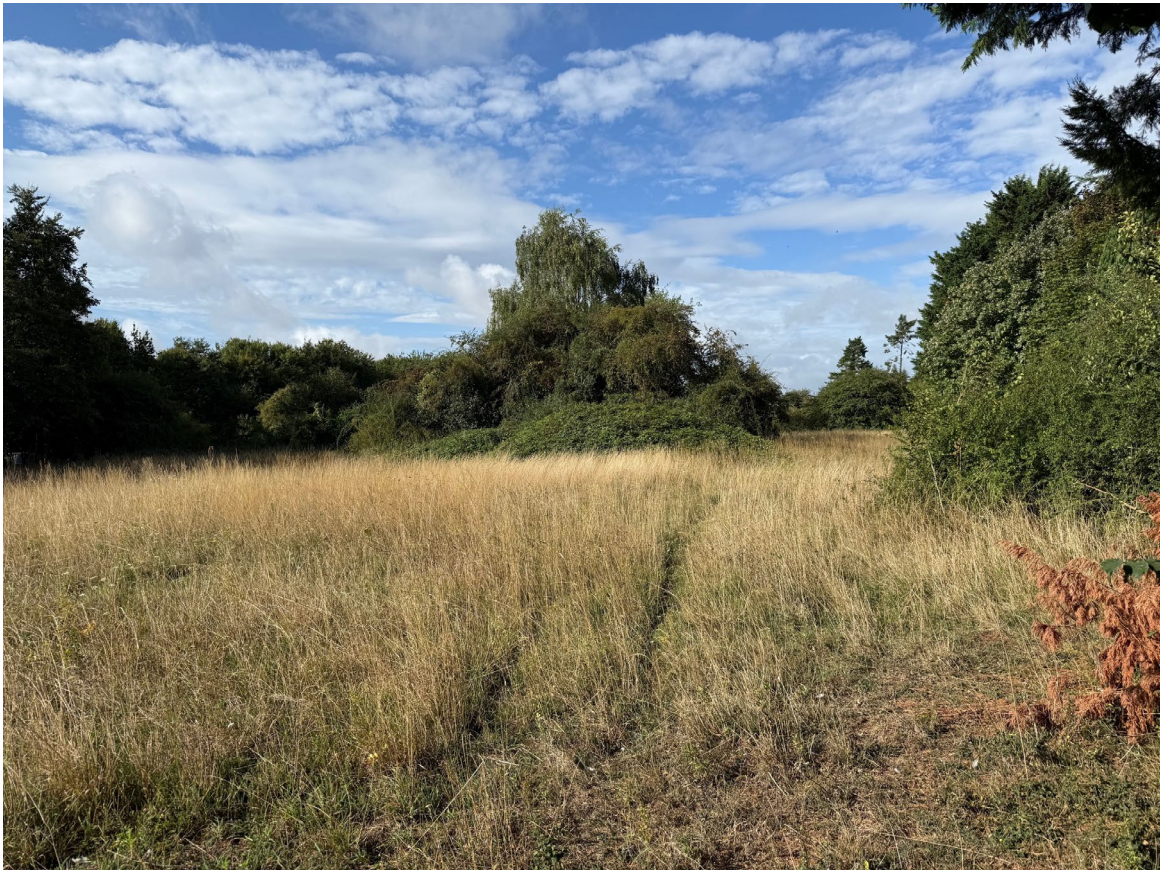
View from within the site looking west