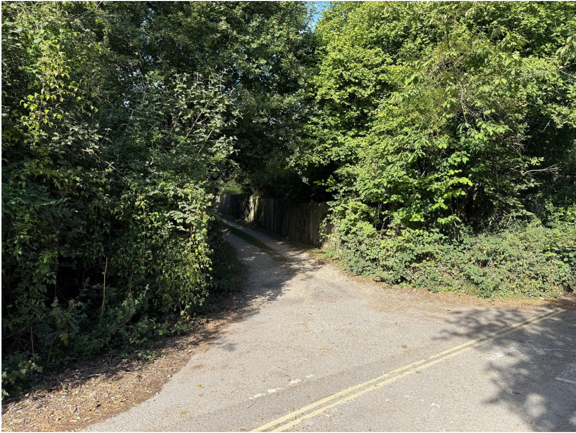
View of the access to the site from Court Drove looking west