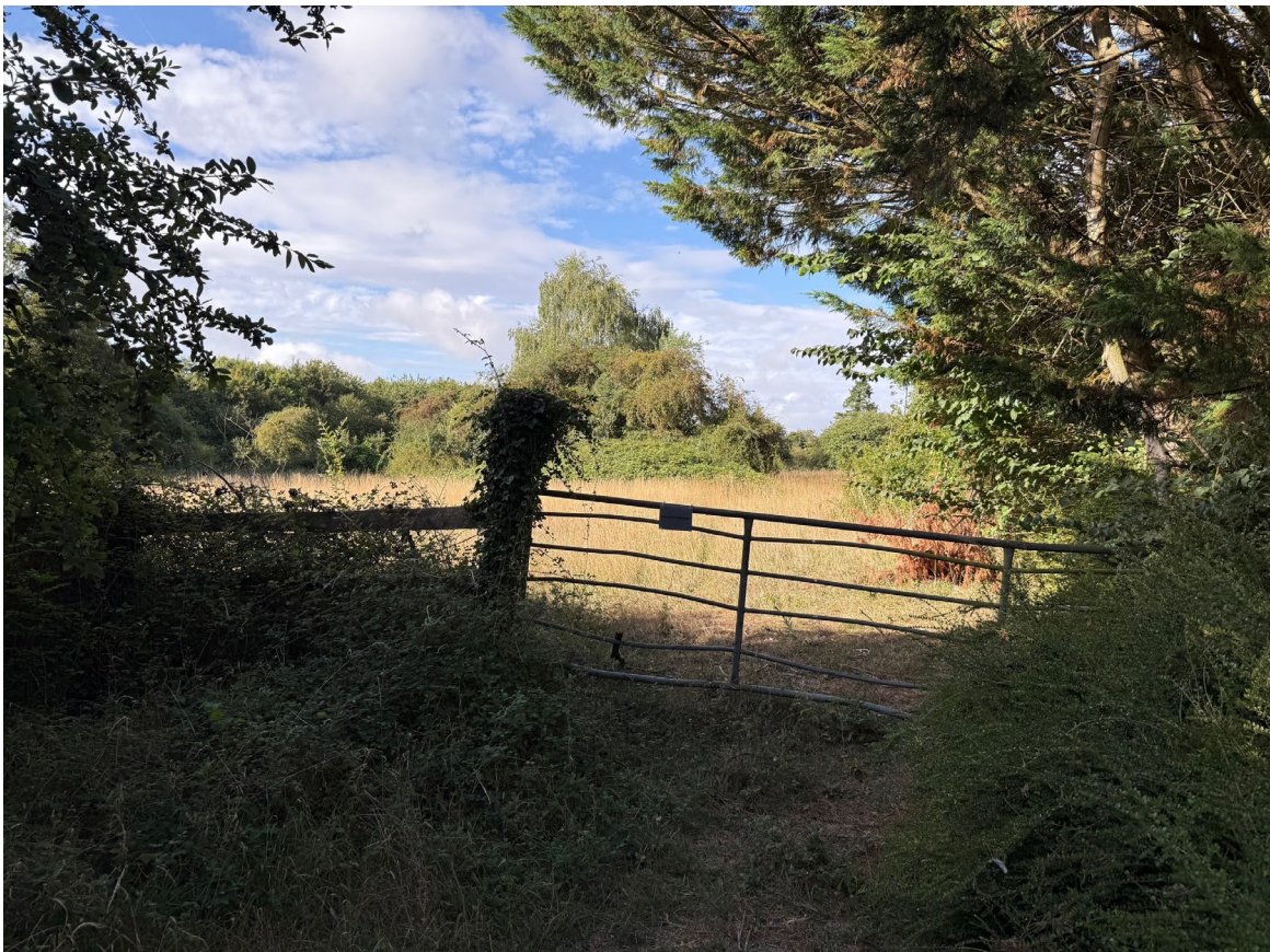
View of the entrance to the site looking west