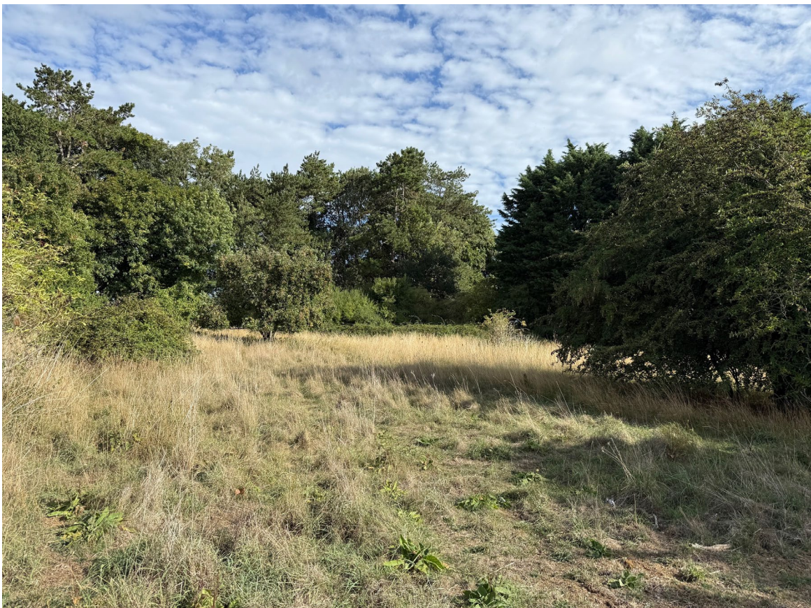
View from within the site looking north