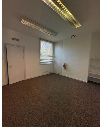
Ground Floor: Rear Office