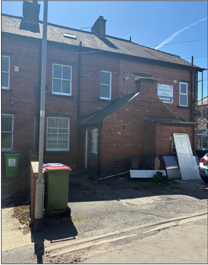
Rear Yard/Car Parking Space(s)