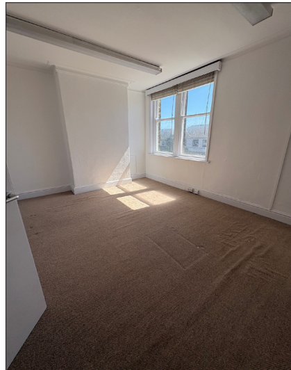
1st Floor: Front Office