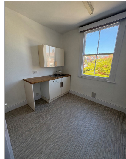
1st Floor: Kitchenette

114 NEW ROAD SIDE, HORSFORTH, LEEDS, LS18 4QB