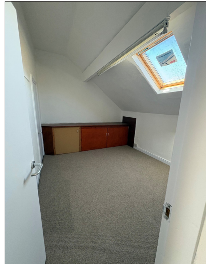
2nd Floor: Rear Office