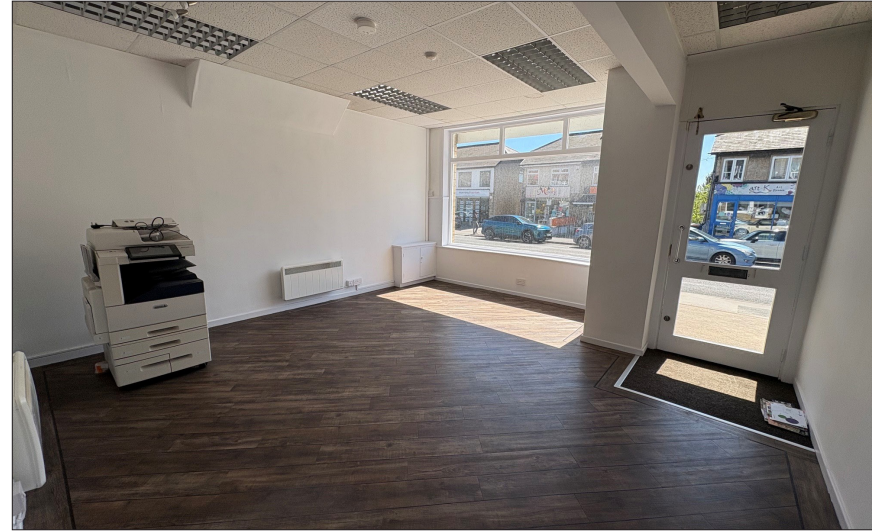
Ground Floor: Front Office