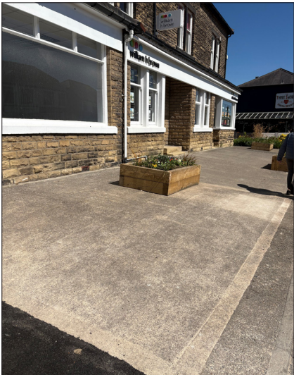
Front External Seating/Activation