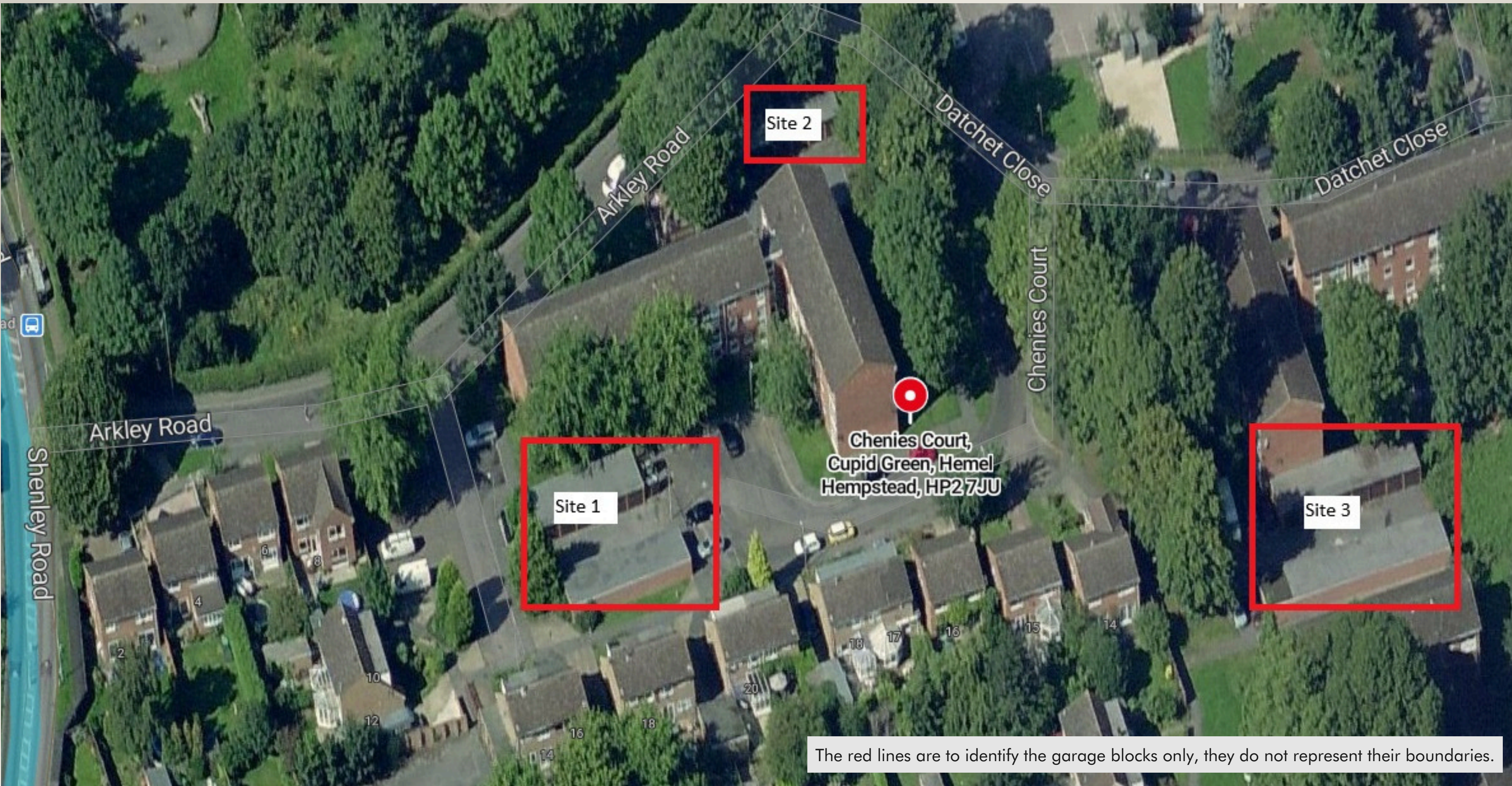
The red lines are to identify the garage blocks only, they do not represent their boundaries.

THREE GARAGE SITES WITH PLANNING FOR RESIDENTIAL DEVELOPMENT | FOR SALE