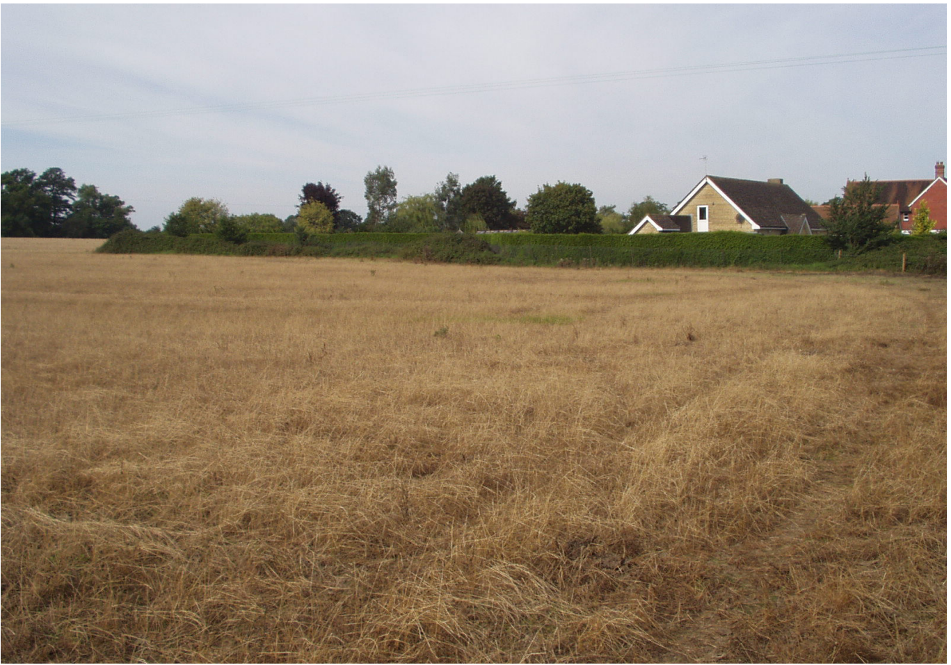
View from within the property looking North