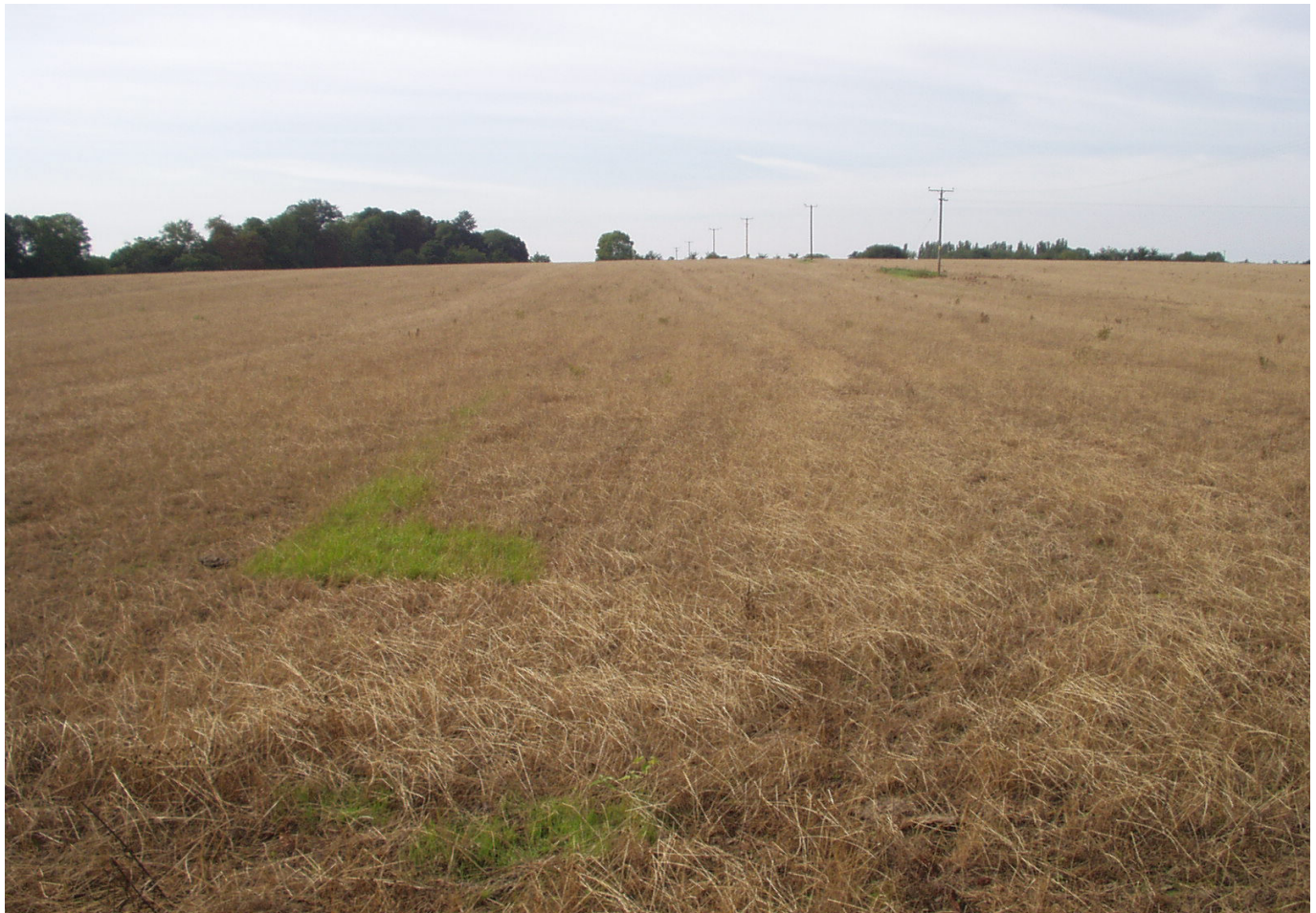
View From Within The Property Looking West