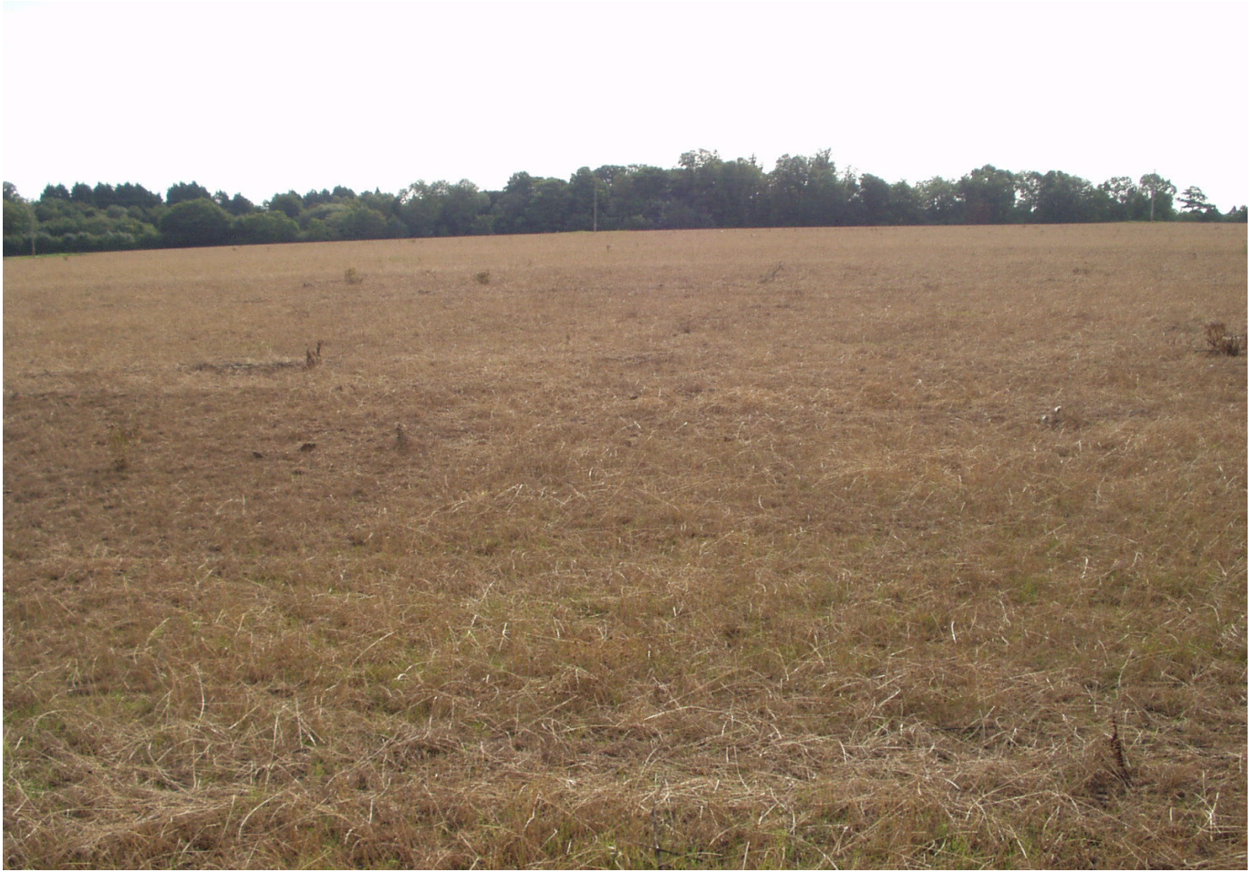
View From Within The Property Looking South