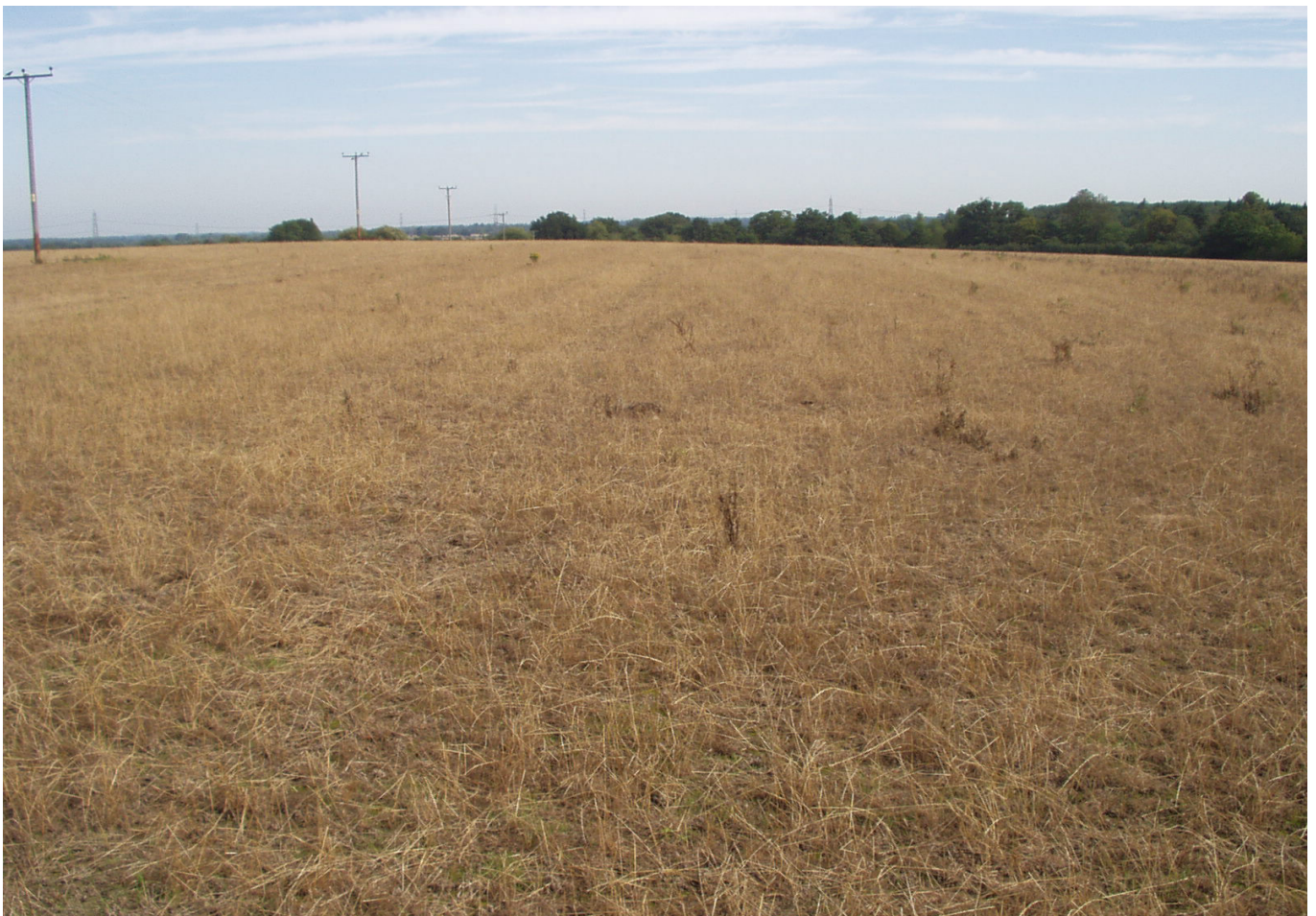
View From Within The Property Looking East