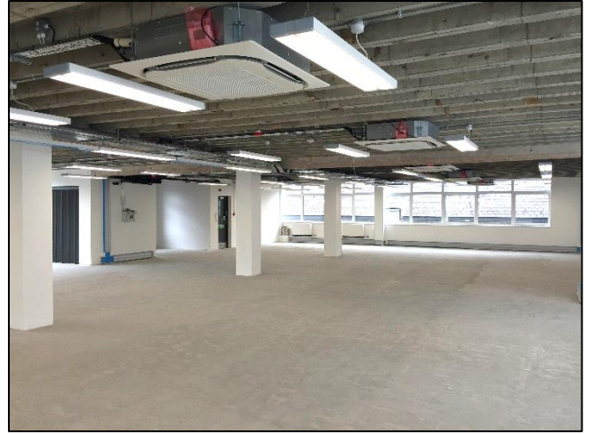
*Typical floor in the building