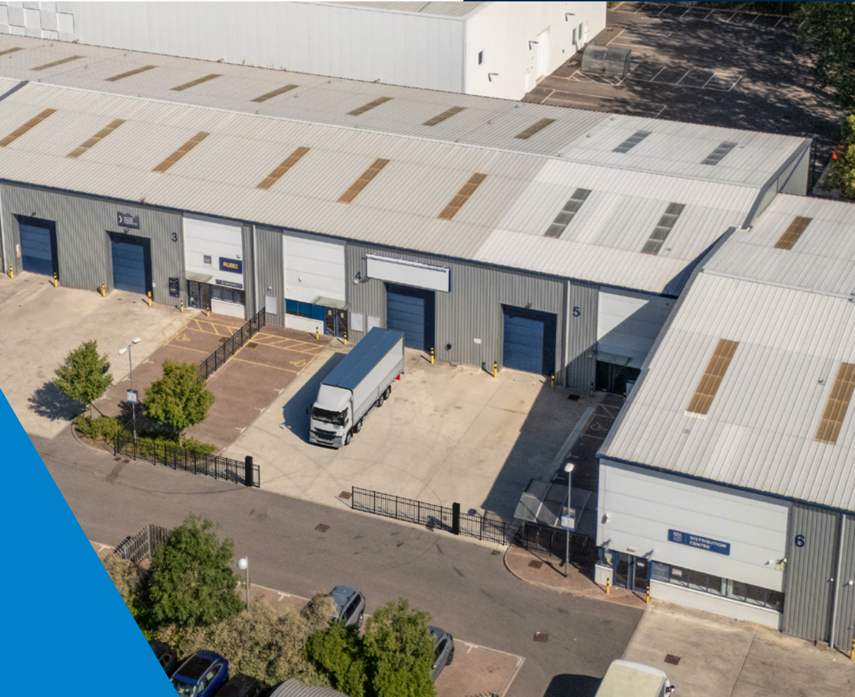
Indicative secure yard.