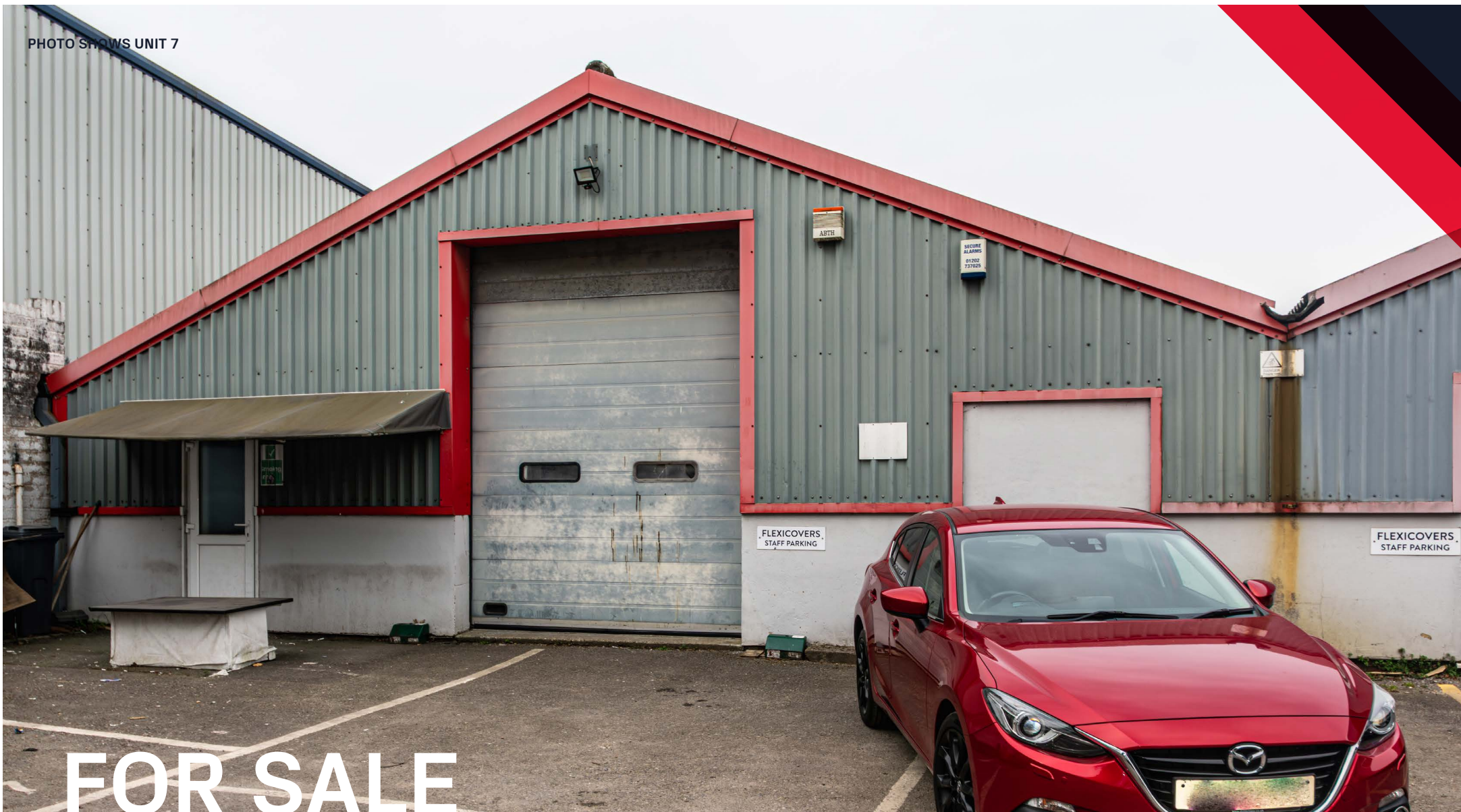
PHOTO SHOWS UNIT 7